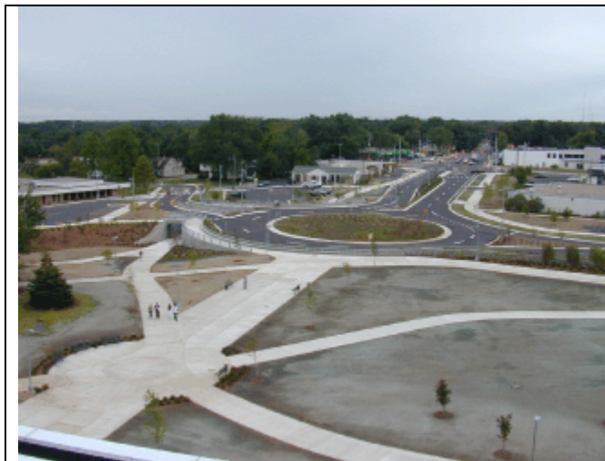
WMU Rbt Pedestrian Underpass to Left

The Department of Blindness and Low Vision Studies at Western Michigan University offers graduate students preparation for becoming orientation and mobility specialists, rehabilitation teachers, teachers of visually impaired children, and rehabilitation counselors. A roundabout was constructed in Summer 2004 at the western entry into campus that includes a pedestrian underpass that routes pedestrians under the roundabout. Unfortunately, not every City or development has the funds to provide this separation between vehicles and pedestrians.