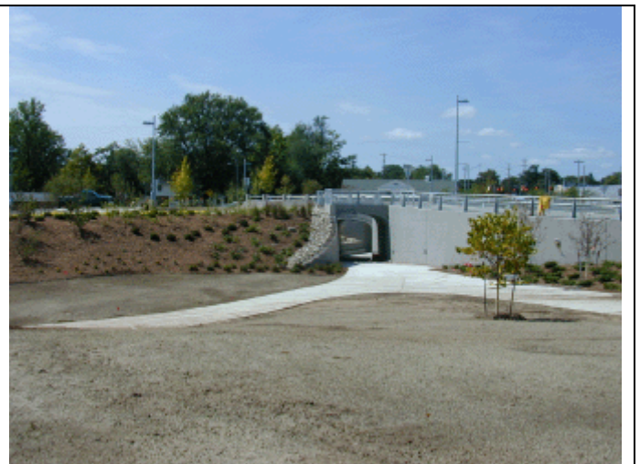
WMU Pedestrian Underpass ( The CSM Group )