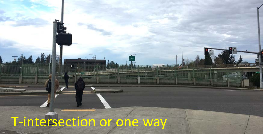
T-intersection or one way