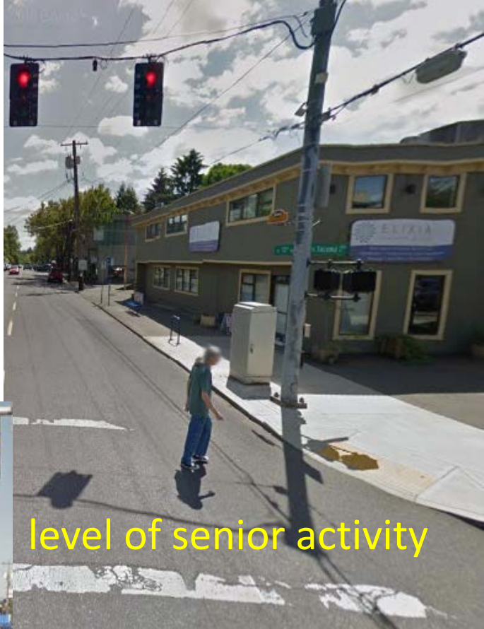
level of senior activity