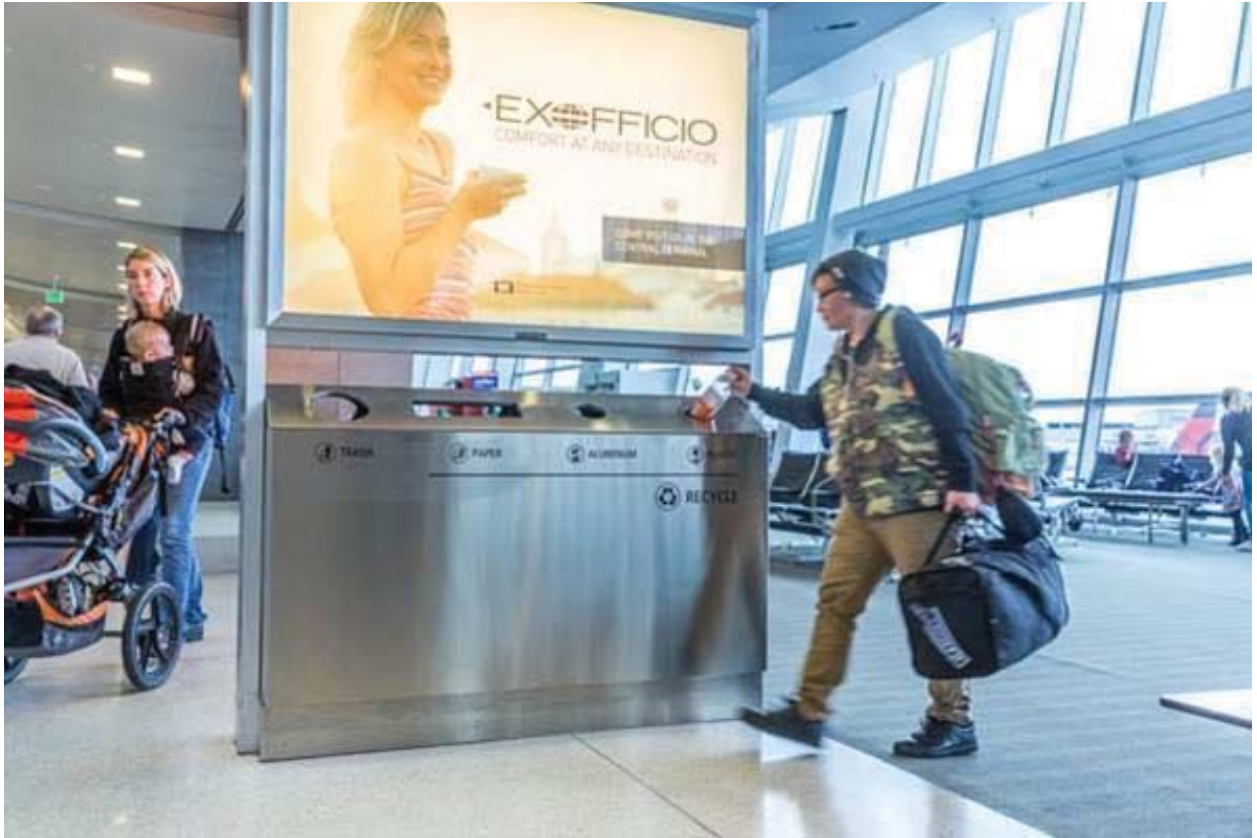
Terminal waste, recycling, and compost containers; courtesy of Port of Seattle