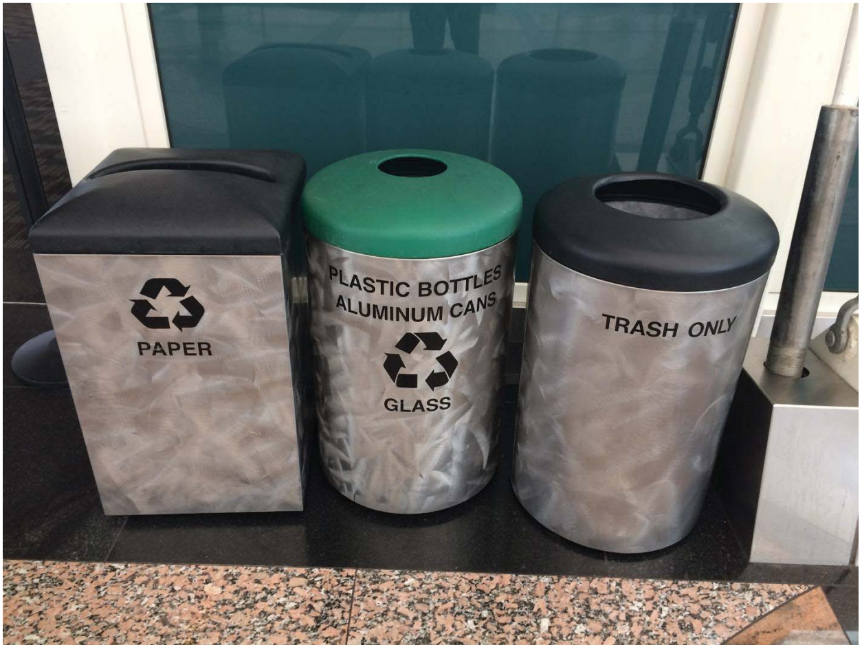
Terminal waste cluster, courtesy of Denver International Airport