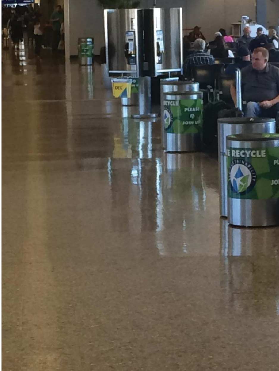
Terminal waste and recycling stations