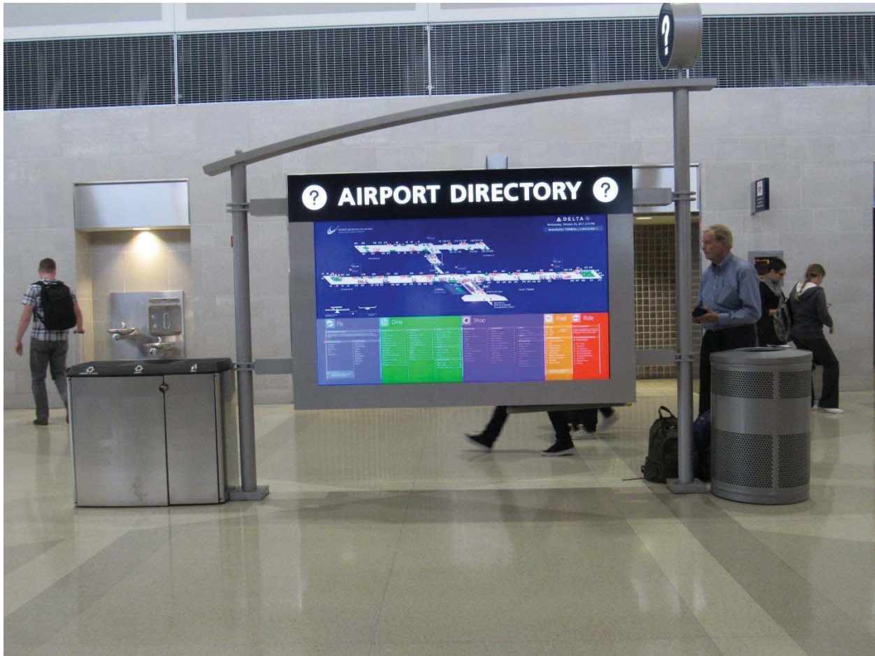
Terminal conjoined bins for recycling and waste streams as well as standalone cans