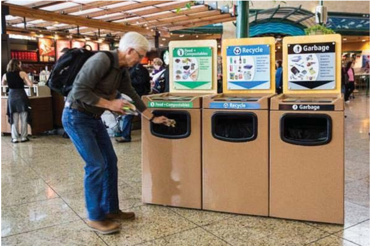
Food court waste, recycling, and compost containers; courtesy of Port of Seattle