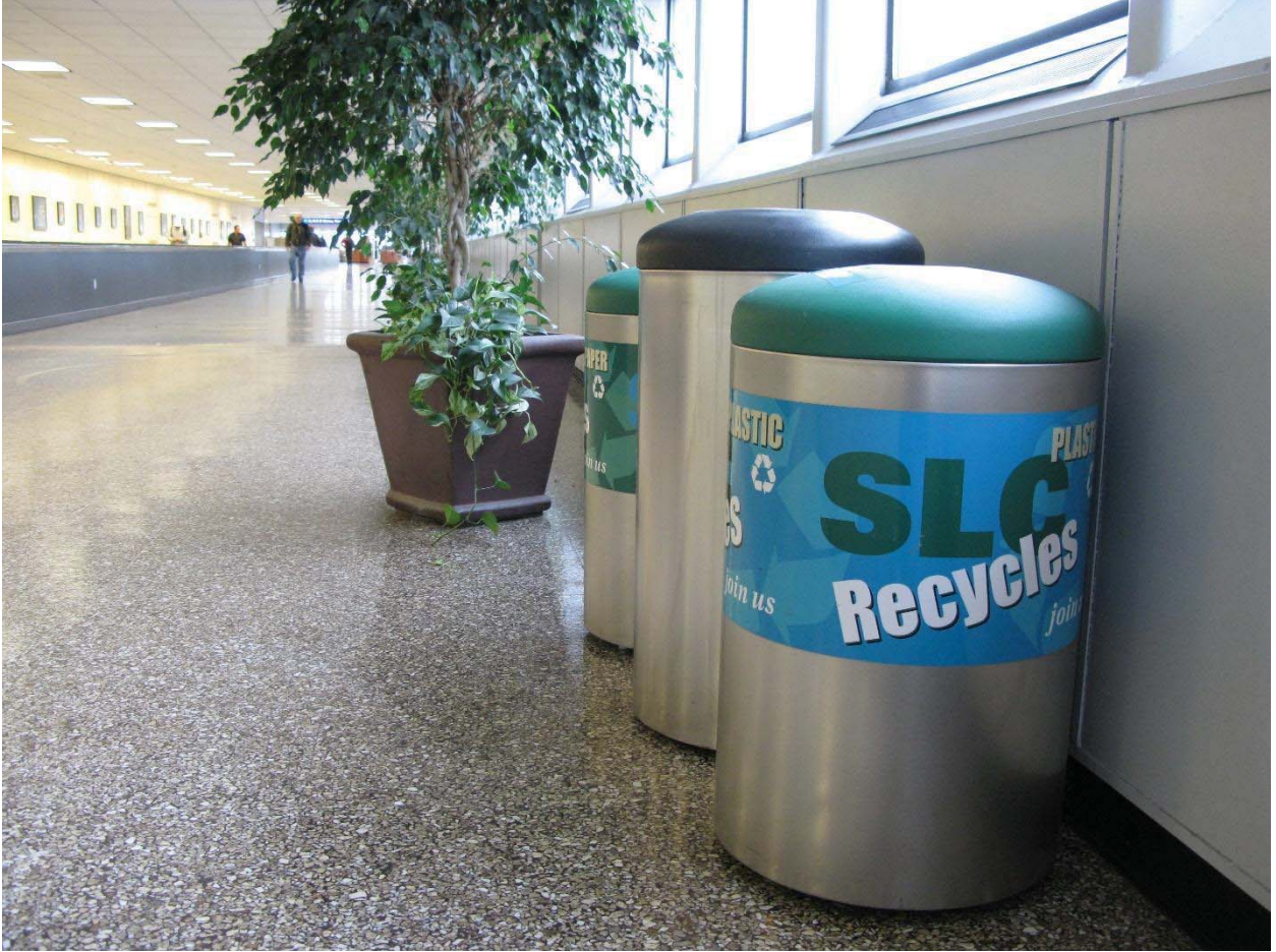
Previous recycling and waste containers (group of three)