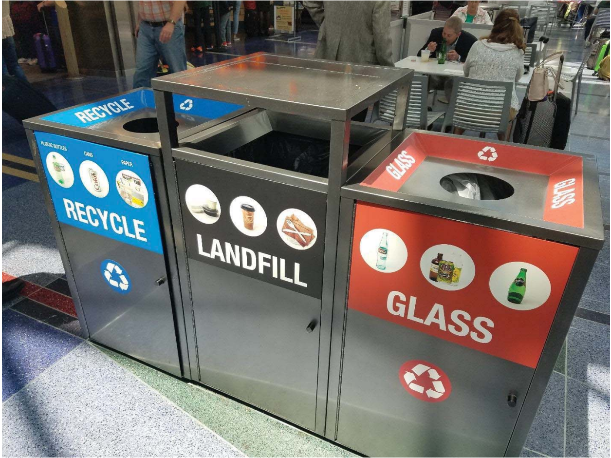
Waste and recycling containers in concourse food court; courtesy of Port of Portland