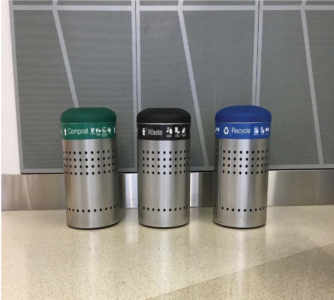
Standard signage integrated on waste and recycling cans; courtesy of San Francisco International Airport