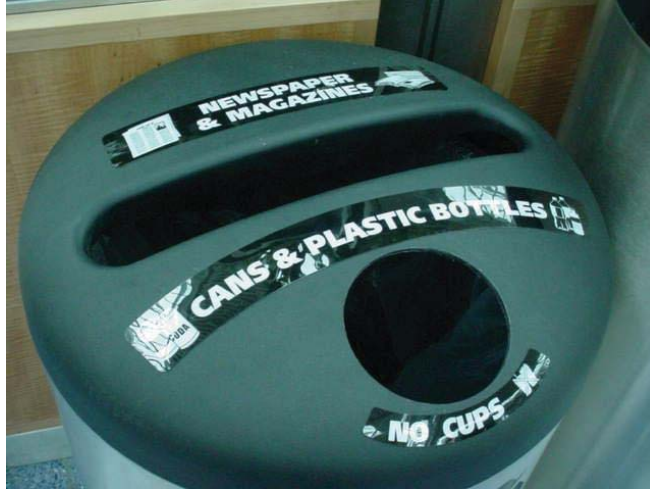
Lid of recycling container; courtesy of Port of Portland.