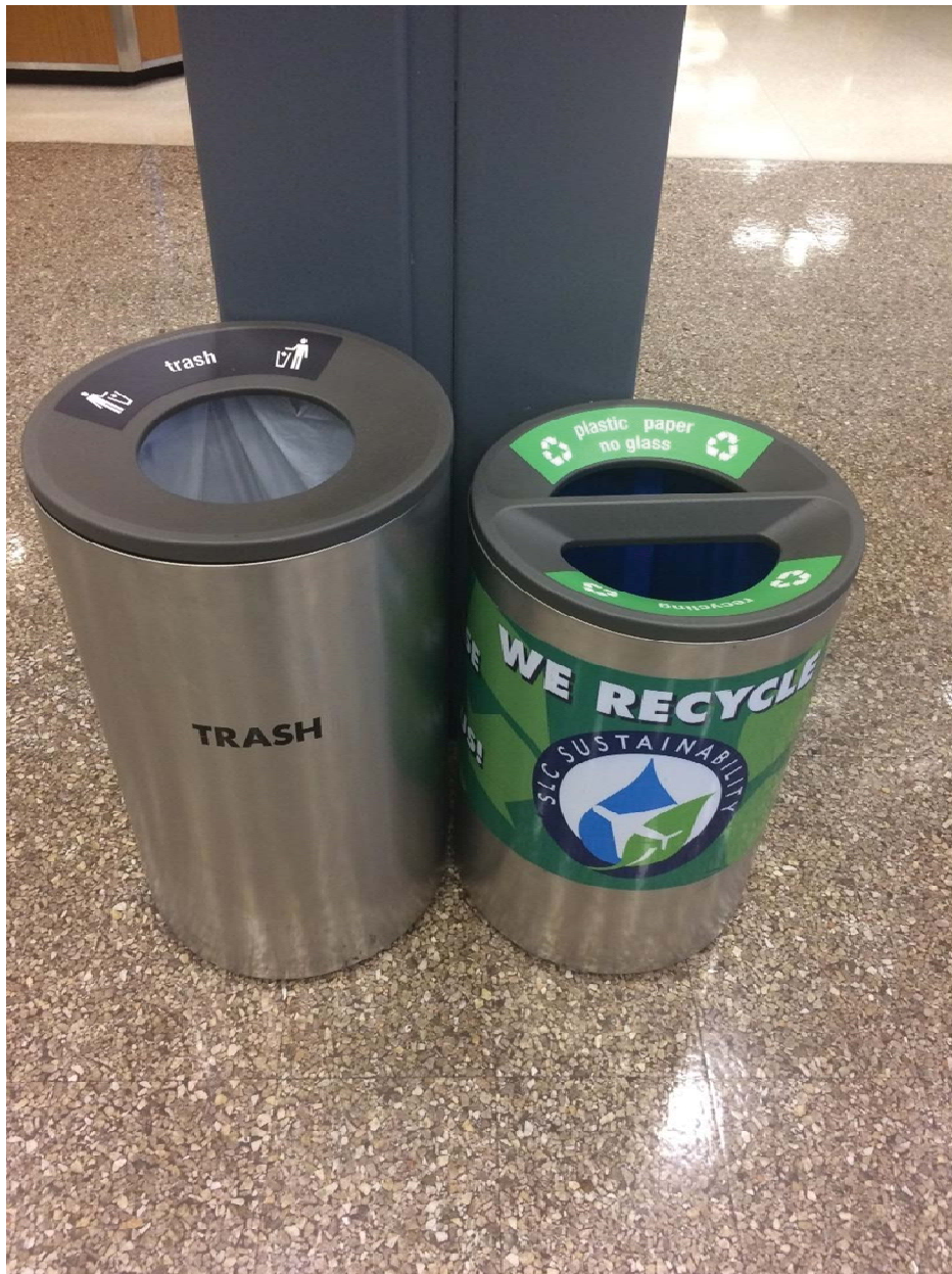
New recycling container labels and restrictive lids