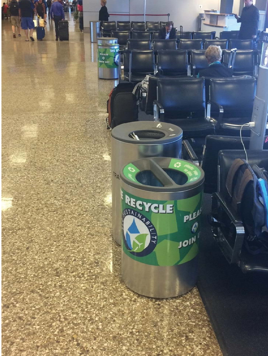
Collocated waste and recycling containers (groups of two)