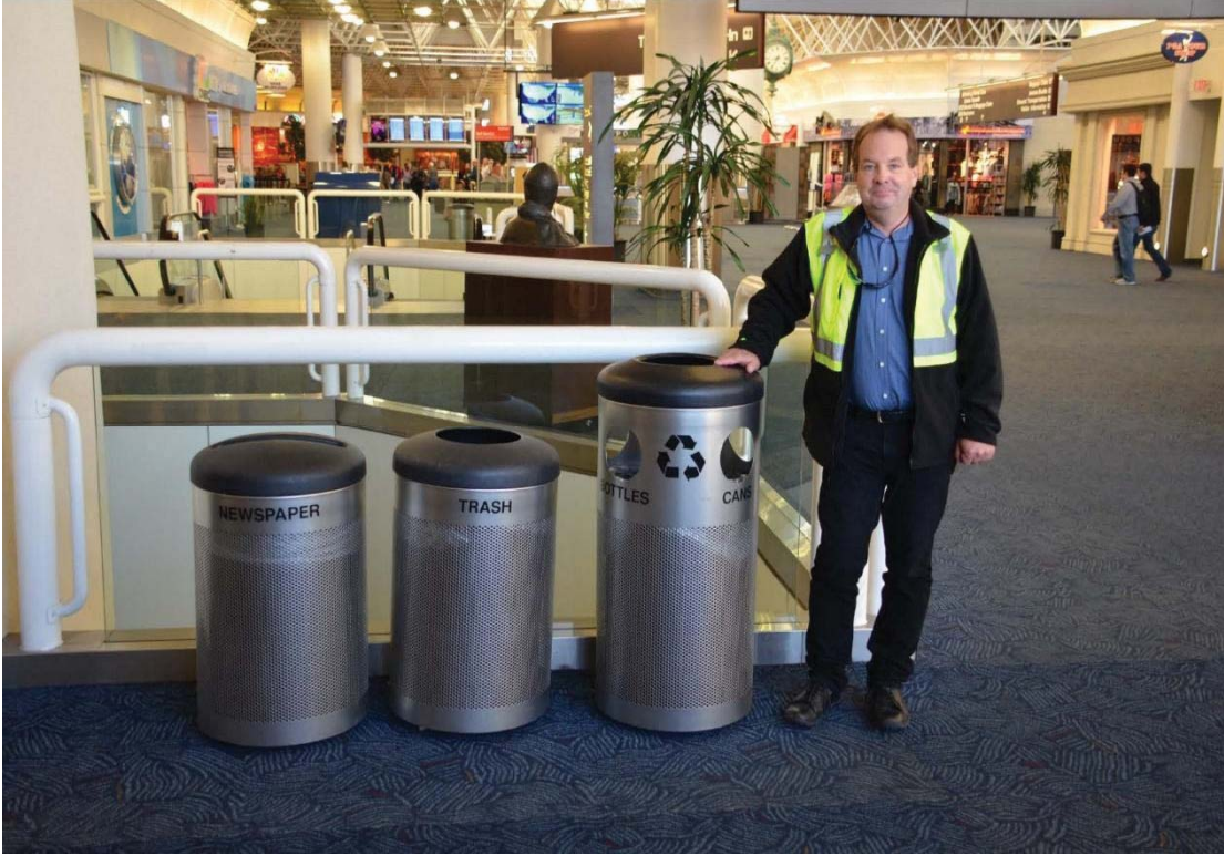
Terminal recycling bins and waste containers