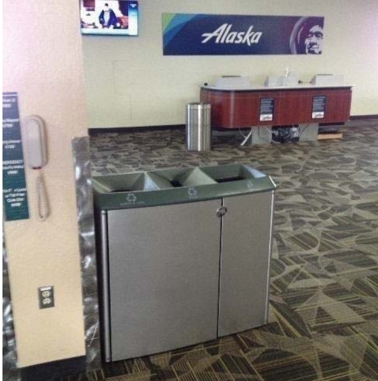
Terminal recycling stations, courtesy of Reno-Tahoe International Airport.