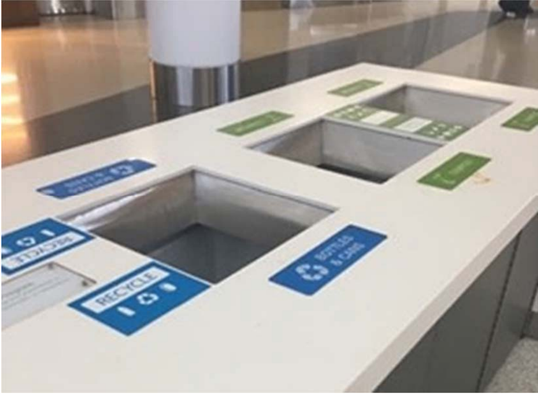
Standard signage integrated on waste station