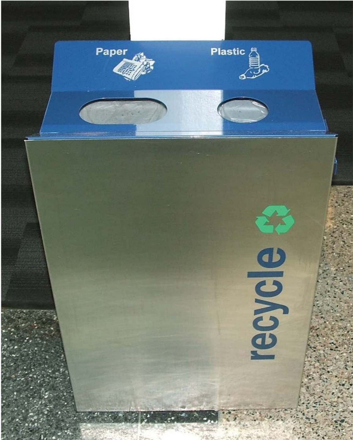
Terminal recycling stations, courtesy of Tulsa International Airport