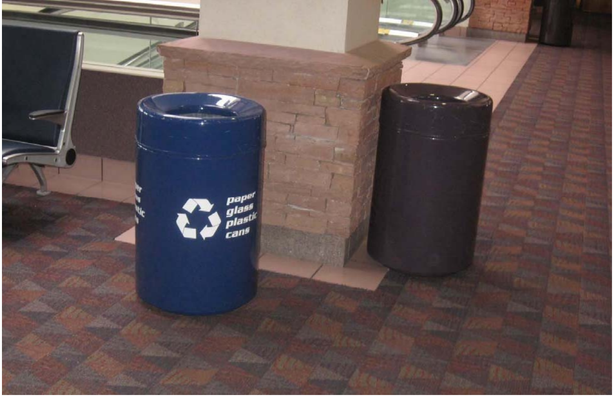
Terminal recycling bin and trash can