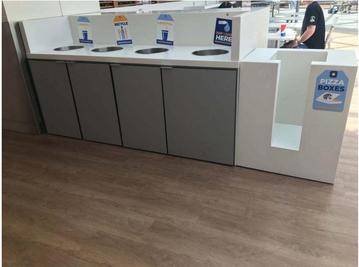
Terminal food court recycling station