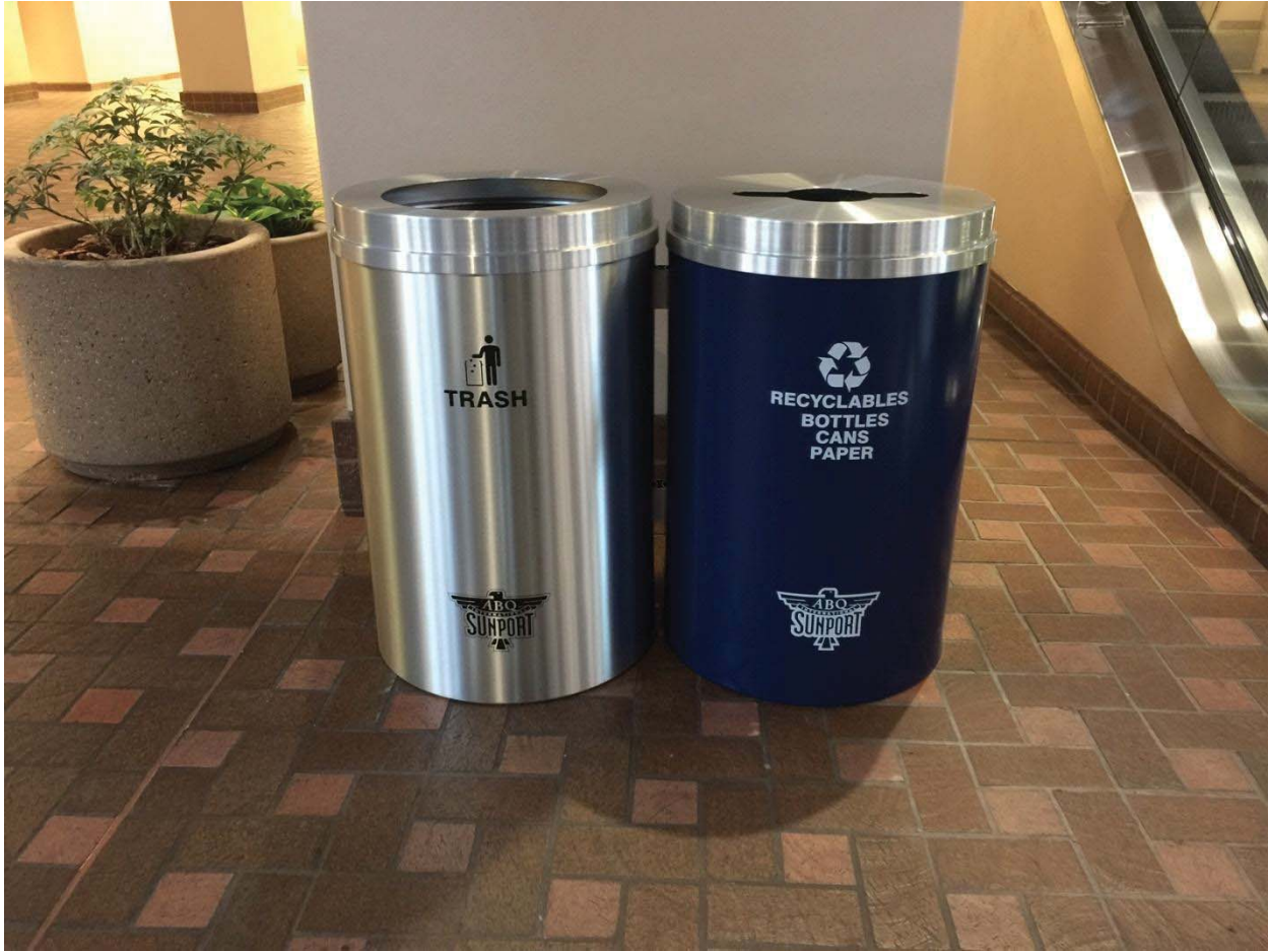
New recycling and waste containers