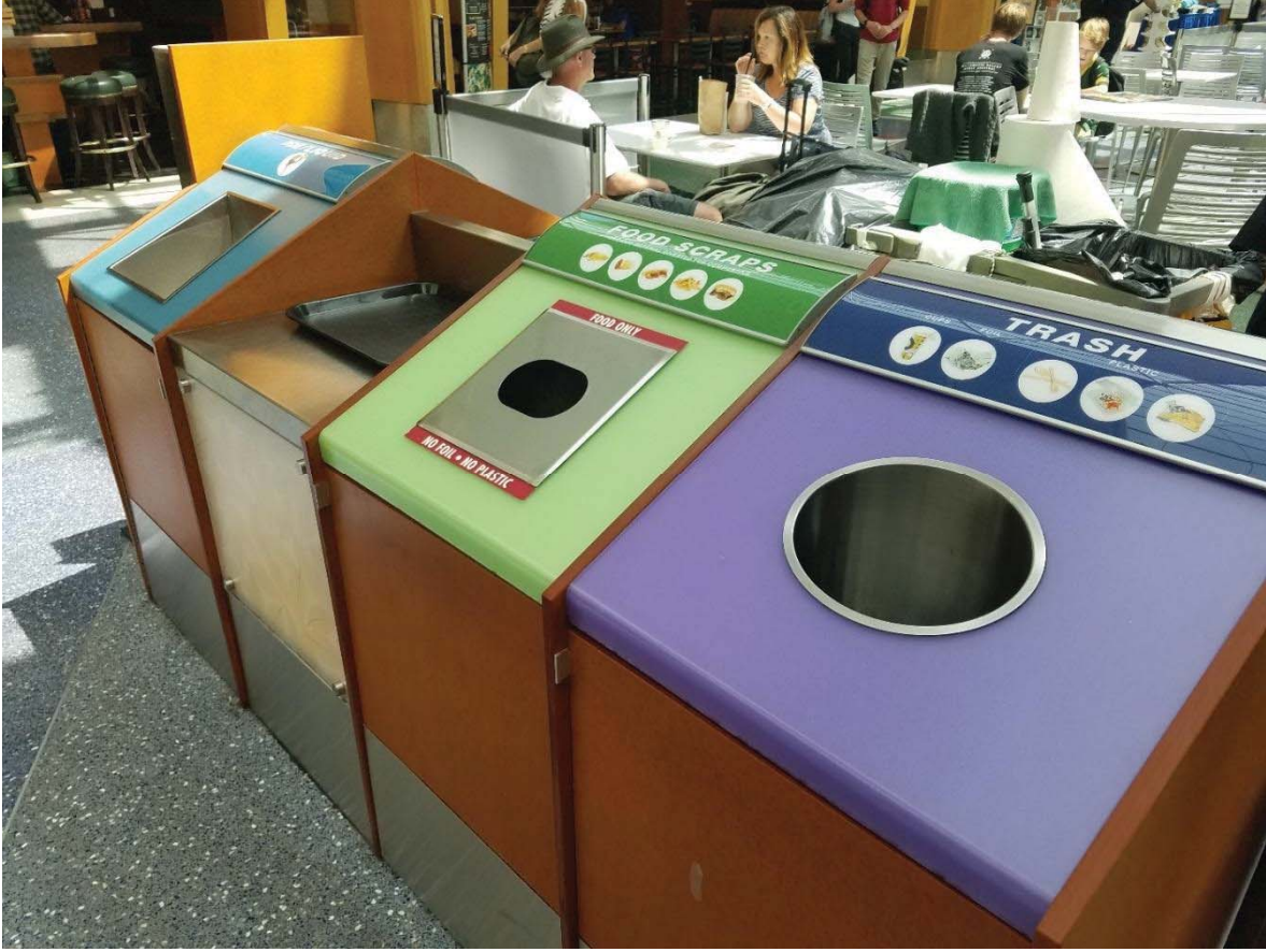
Trash, food scraps, and beverage collection unit in concourse food court; courtesy of Port of Portland.