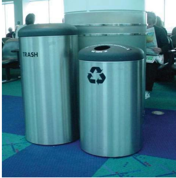
Terminal public space waste and recycling containers; courtesy of Port of Portland.