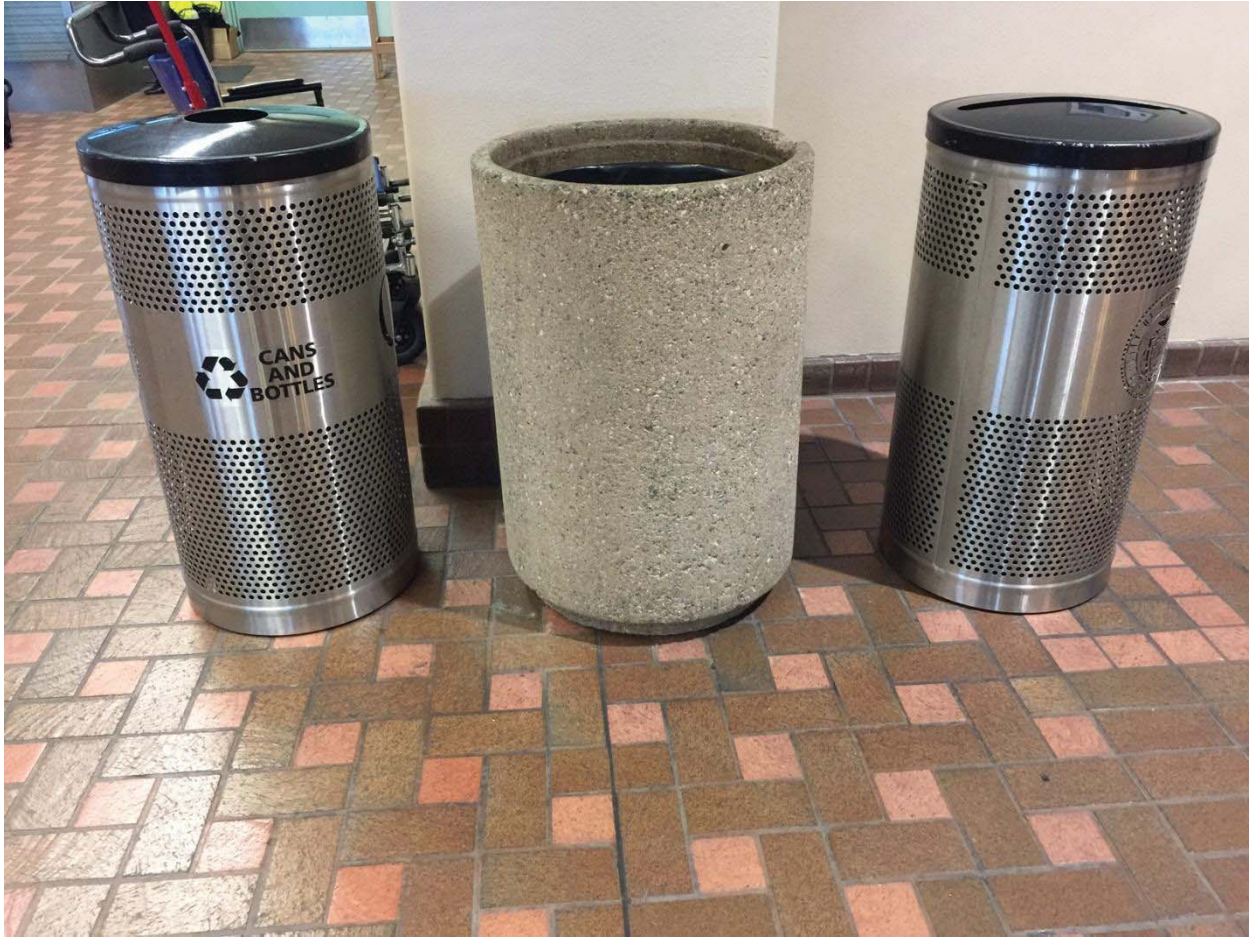
Previous recycling and waste containers