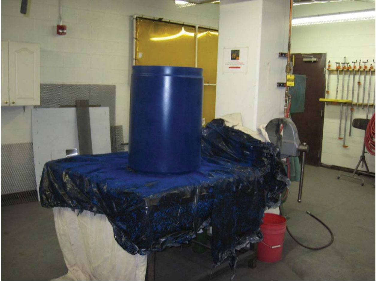
Conversion of trash can into recycling bin