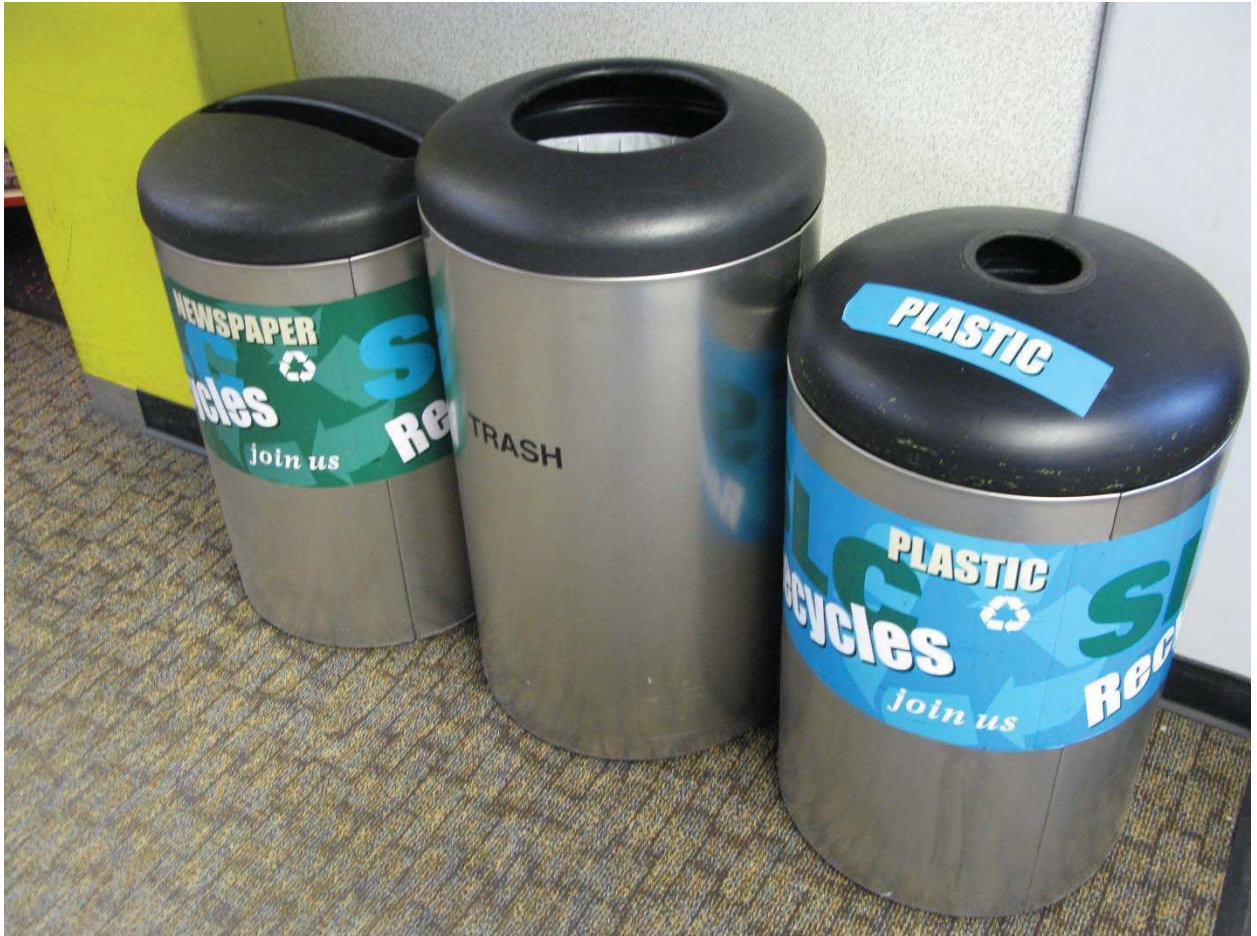
Previous recycling and waste containers (group of three); courtesy of Salt Lake City Department of Airports