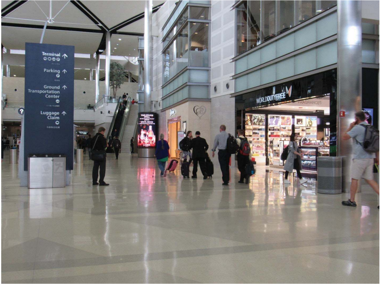
Terminal conjoined bins for recycling and waste streams as well as standalone cans, courtesy of Wayne County Airport Authority