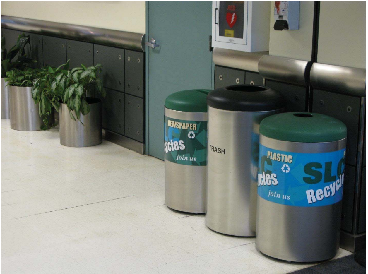
Previous recycling and waste containers (group of three)