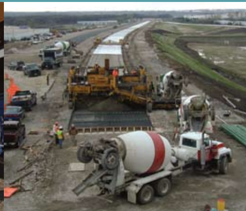
Slip form paving to extend Illinois North-South Tollway (I-355)