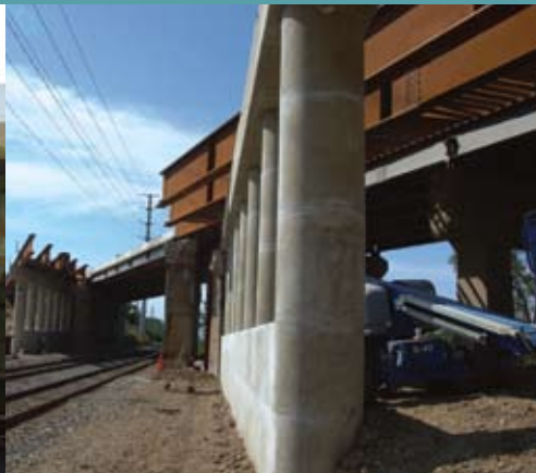
Railway overpass of advanced, weldable, weathering steel, Lake Villa, Illinois