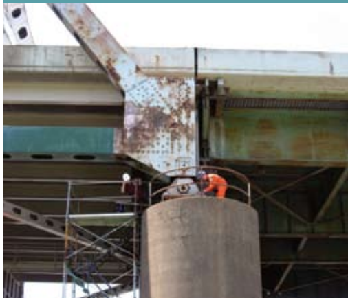
Wireless remote strain monitoring equipment, J.F.K. Bridge, Ohio River at Louisville