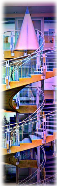
The Atrium staircase at The Keck Center of the National Academies.