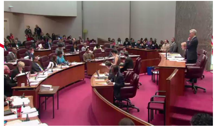
Chicago City Council