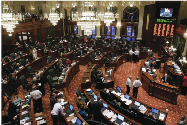
Illinois State Legislature