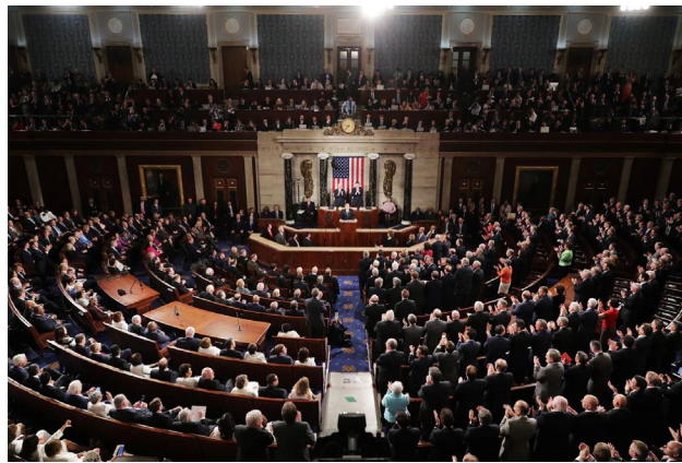
United States Congress