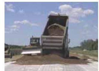
Tying G CBD into edgedrain during installation in a Minnesota DOT test track (left), and covering the G CBD with base course aggregate in the test section (right).

Sensors are monitoring moisture and temperature changes in the G CBD test section and in an adjacent control section and the resulting data will allow for performance analysis. Design tools calibrated with the field data are under development so that the G CBD can be designed for specific climates, geometry, and soils. This technology is available for licensing and manufacturers of geosynthetic products have expressed interest.