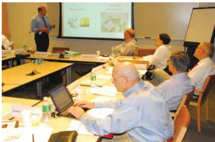
Members of the Transit IDEA committee listen to a progress report from an investigator.