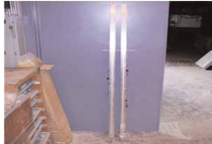
The cone penetrometer equipped with piezoelectric sensors.

Using the project's cone penetrometers equipped with piezoelectric sensors, three indicators of soil stability—shear modulus, elastic modulus, and Poisson's ratio—can be measured to a depth of 4 feet. During tests of two soil types, results from the penetrometers compared favorably with results on the same soils