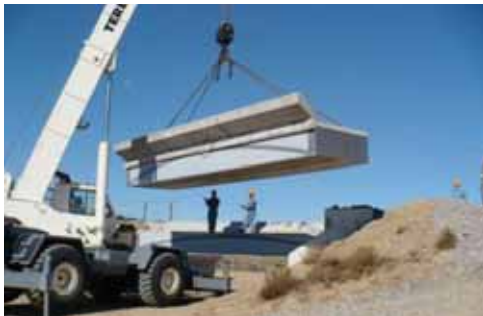
One of eight 30-foot hybrid composite bridge beams is installed for load tests in a railroad test track.