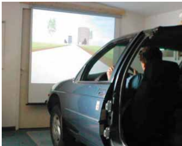
The DAISY simulator could help drivers stay alert.

real vehicle performing the same maneuvers. As a series of driving tests were conducted, algorithms were enhanced with the resulting data. Results of the driving tests were translated into an alertness indicator, which was then compared with an index produced by the subjective judgment of two investigators who independently reviewed video of the test subjects and graded their level of alertness. The comparative analysis indicated validity of the principles that govern DAISY. Sphericon, Ltd. has scheduled demonstrations of DAISY with a major automotive manufacturer to take place later in 2007.