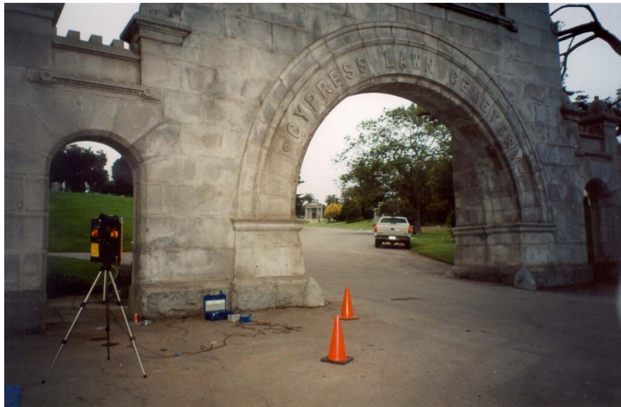
Figure 3. Cypress Lawn Cemetery Grand Gateway

Figure 3 shows the archway and a seismograph used for monitoring vibration. In addition to the seismograph at the base of the archway, there was an alarm system with warning lights (yellow for caution and red for exceedance) and an audible alarm. The warning system provided a direct feedback to the equipment operators when vibration limits were being approached or exceeded and allowed equipment operators to adjust their activity. After an initial learning stage of trial and error, the system became a reasonably successful tool to control vibration.