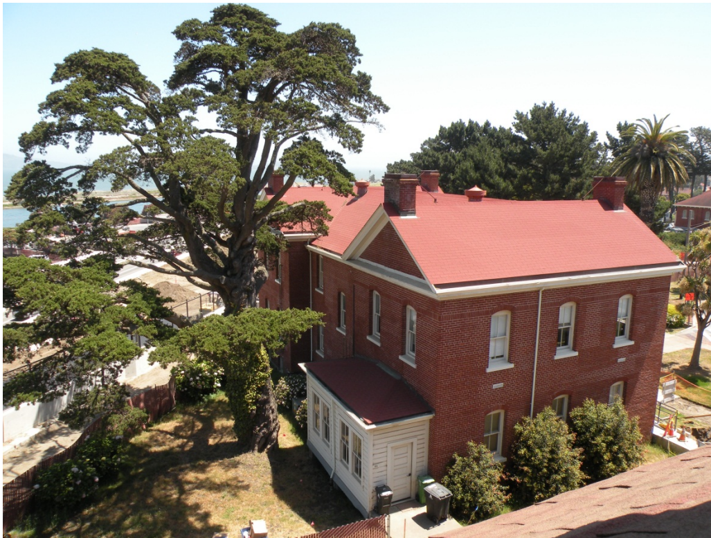
Figure 8. Buildings at the Presidio

“[A] ground vibration PPV of 2 mm/sec (0.08 inches/sec) would be a conservative, but appropriate limit for the historical buildings that are more susceptible to damage, including those in a poor structural condition and those of masonry construction. The buildings in the Main Post area of the Presidio are mostly of masonry construction and would therefore fall into this category. In addition, visual observation of the buildings under consideration in this study indicates some existing differential settlement and cracks in the facades of the brick buildings. However, most of the other historical buildings in the Presidio are wood-framed structures which are substantially less susceptible to damage from vibration. For most of these buildings, a higher PPV of 5 mm/sec (0.2 inches/sec) would be an appropriate, conservative limit for construction vibration. The exterior facades of some of these wood-framed buildings (such as the Mason Street warehouses) are in a poor condition, although it is understood that these buildings are structurally sound.”