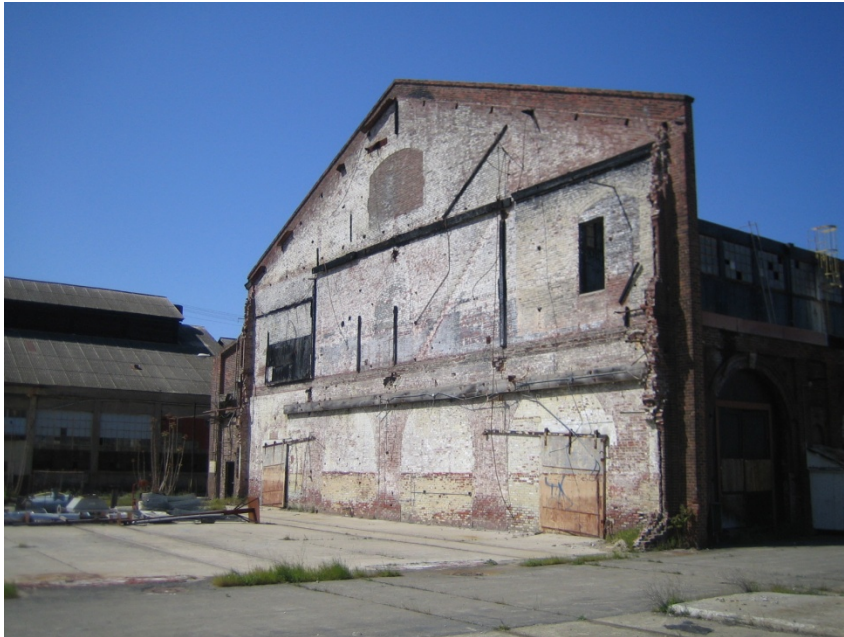
Figure 2. Car Shop within the Sacramento Railyards Central Shops Historic District

During the project’s design phase, the owner engaged a structural engineer to evaluate the condition of the buildings and the effect of future train vibration. The engineer concluded from a visual review that even though the maximum predicted vibration exceeded the FTA criterion, the vibration was not expected to cause any risk to the existing masonry walls (structural or cosmetic), with the exception of one building (Car Shop), which had a large cantilevered wall (i.e., unsupported laterally). Figure 2 shows the outside of the Car Shop’s unsupported wall.