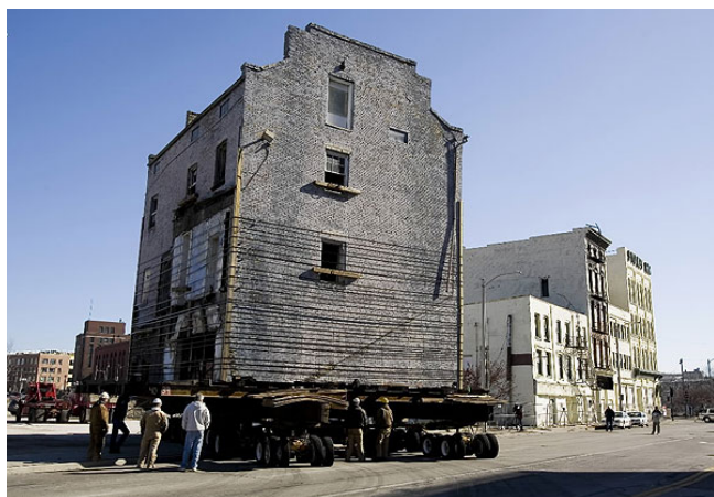
Figure 5. Gipfel Brewery building being moved