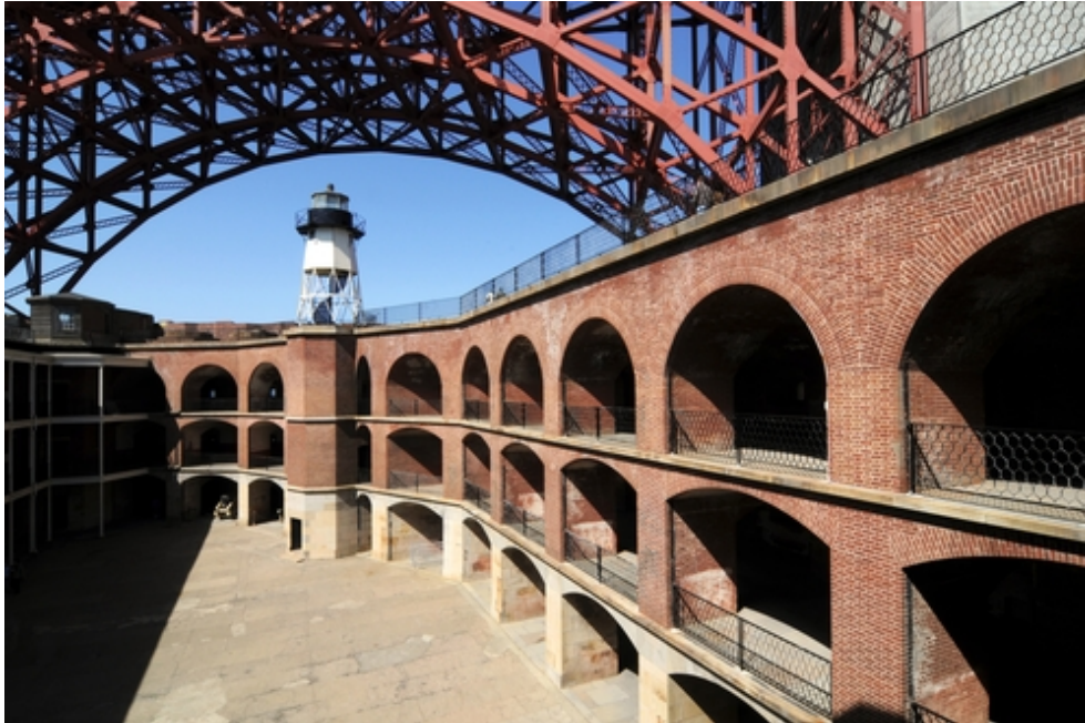
Figure 7. Fort Point and Golden Gate Bridge

During Phase 1 remediation, cast-in-drilled-hole (CIDH) piling and pile caps were added around the perimeter of the original bridge foundation pedestals. The interface of new concrete to existing concrete was strengthened with post-tensioning of monostrands, clamping the new footings to the pedestals of the existing foundations. The existing grade beams between the foundation pedestals were also substantially strengthened, and additional grade beams were constructed. After the existing towers supporting the bridge were removed, the second stage of the foundation retrofit proceeded. First, the remaining upper portions of the existing pedestals were demolished. Then, new upper pedestals were constructed and closure pours placed to incorporate these elements into the entire foundation system. The erection of a new tower followed.