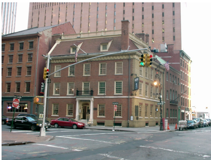
Figure 6. Fraunces Tavern.

The potentially affected buildings in the historic district were constructed between 1820 and 1970 on fill placed in the area during the 17 th Century. The historic buildings included 16 three and six story buildings located on one city block. The engineers indicated in their investigation that some of the buildings had undergone extensive renovations. Figure 6 shows Fraunces Tavern, one of several historic buildings within the Fraunces Historic District.