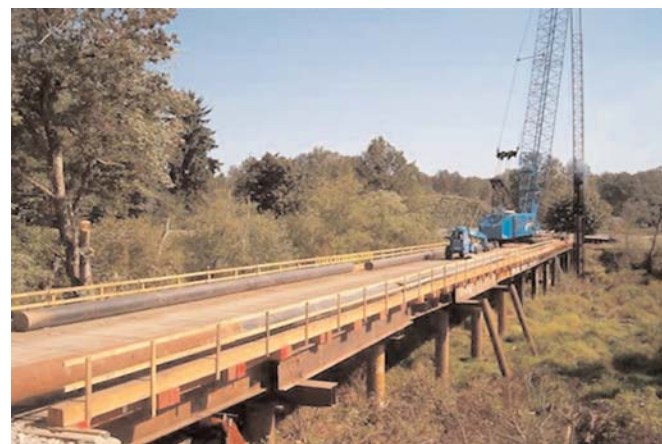
Figure 2 Temporary contractor designed trestle bridge used for construction of Tolt bridge, King County, WA.

Piles. Steel pipe piles, steel H-piles, or other materials must be driven to sufficient bearing to support both the dead load of the trestle and the live load. In determining the live load, not only the equipment