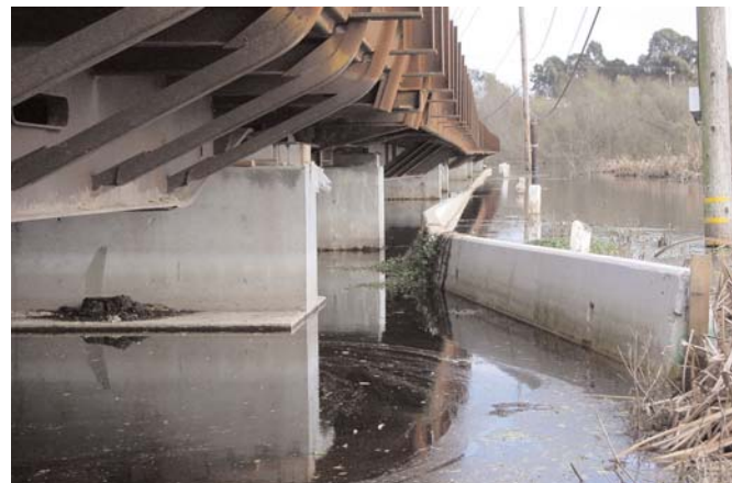
Skip Gibbs Co.

Substructure design considerations. A typical bridge substructure might consist of one of the following systems: