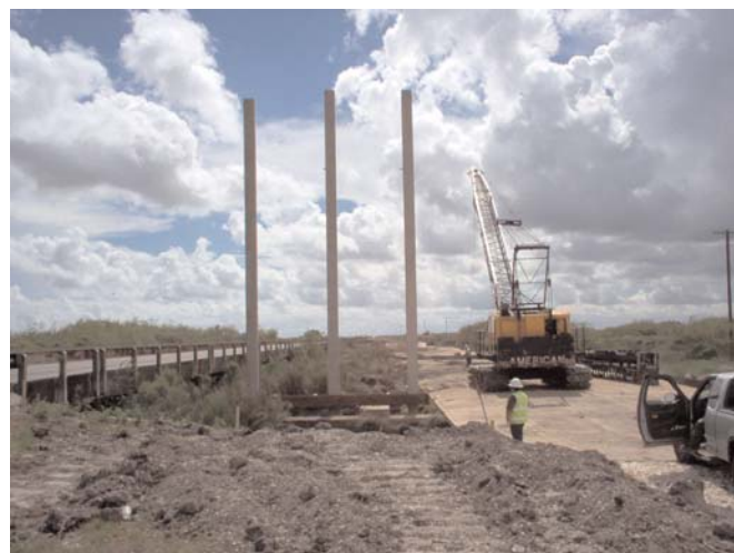
Figure 6 A composite mat system provides construction equipment access at the Cavasso Creek bridge project in Aransas County, TX.

Due to the weight of the mats and the equipment bearing directly on them, most of the native vegetation will be damaged or destroyed, and some small animal life could be smothered. However, since the mats will be in place for a very limited time, some types of vegetation may re-establish on their own. Depending on the stability of the underlying subsurface soil,