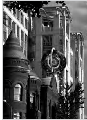
TRB is headquartered at the Keck Center of the National Academies, 500 Fifth St. NW, Washington, D.C.

Once research starts, administrative and technical oversight of progress is performed by NCHRP staff. In-depth oversight by project managers with wide-ranging expertise is an important factor contributing to project success.