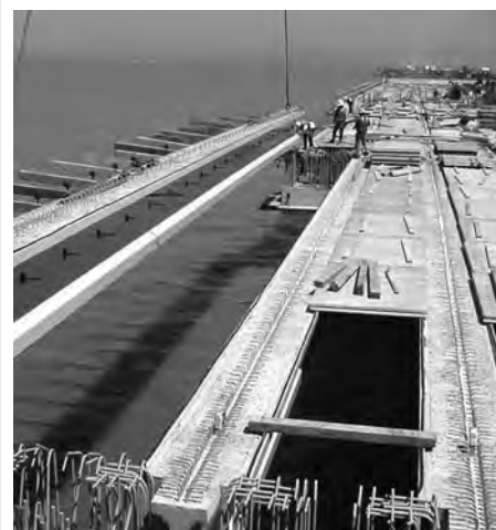
NCHRP research helps California advance accelerated techniques in seismic areas.

For more information about any of these publications, visit NCHRP’s website ( www.trb.org/nchrp ) or AASHTO’s online bookstore ( bookstore.transportation.org ).