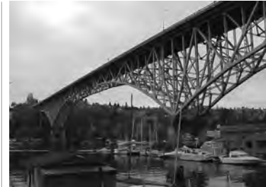
The Aurora Avenue Bridge in Seattle was seismically retrofitted with base isolation bearings.