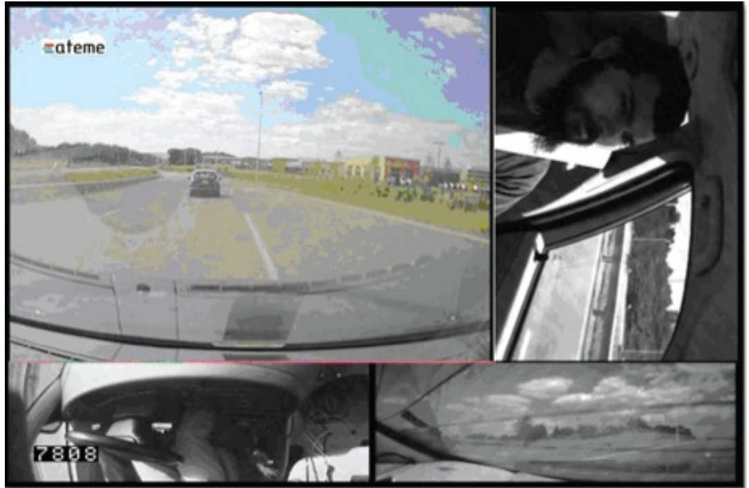
The four fields of view from the car's interior are combined in a single frame and compressed for efficient storage.

Visit the InSight website to access NDS data at one of three levels: