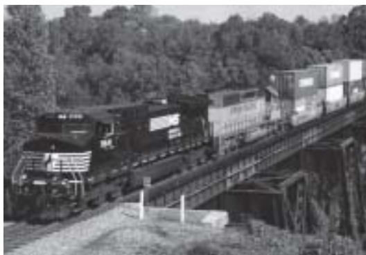
McLean worked with Southern Pacific Railroad to develop the double-stack freight car.