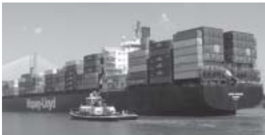
The Hapag-Lloyd containership Essen Express bringing a load of containers into Savannah Harbor, Georgia.

The first 50 years of the containership era can be viewed through different prisms. Naval architects and merchant seamen may concentrate on the extraordinary evolution of containership design that has progressed from the converted T-2 tanker Ideal X and the C-2 cargo ship Gateway City to vessels with capacities approaching 10,000 TEUs. Shippers may marvel at the wonders of “just in time” chains of international delivery that bring products to market with extraordinary efficiency. Transportation planners may grow exasperated as they seek to develop more seamless links between seaports, highways, and railways, and port officials may wonder how they will find the resources to adapt their harbors for the ever-larger containerships. Economists and political scientists may continue to measure and assess the implications of a global economy in which the clothes and backpacks worn by youngsters heading to school in Middle America were manufactured in factories in the Far East and transported across the Pacific aboard containerships that fly flags of many countries, but rarely that of the United States.