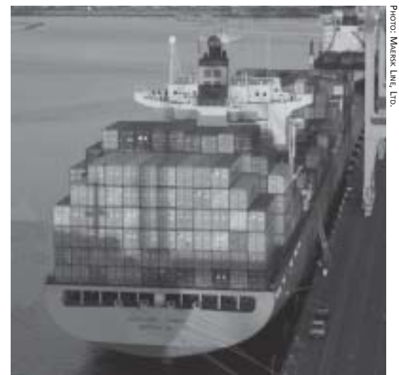
Typical containership with container-carrying holds between the deckhouse and bow, and space for additional containers to be stacked aft of the deckhouse.

On October 4, 1957, the Soviet Union launched Sputnik I, the world’s first earth-orbiting satellite. On that same day, the Pan Atlantic ship Gateway City steamed away from Port Newark and headed south to Miami, then on to Houston. Ideal X had transported containers that were individually attached to a flat spar deck, but Gateway City , a World War II cargo ship identified as a C-2 Class vessel, had been thoroughly rebuilt to stack containers one atop another in below-deck racks and to haul additional