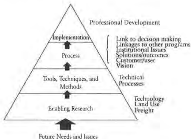
FIGURE 3 Crosscutting issues applied to framework.

The process of identifying a national agenda can be "directed" in a variety of ways. As noted earlier, a logical starting point is the identification of enabling research, that is, those issues, societal trends, and needs for knowledge that lead to subsequent research on the planning process and the tools that are used in this