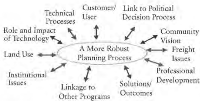
FIGURE 1 Issues from refocusing conference.

In its simplest form, Figure 2 shows a framework for developing such a national agenda. A key concept in this framework is that there are fundamentally different types of research efforts that build off of one another. At the base of the research framework is “enabling research.” This term is borrowed from a recent Transportation Research Board workshop on enabling transportation research (1). Enabling research was defined in this report as “basic and applied research and technology development that supports...long term goals. The characteristics of this type of research that make it appropriate for federal funding are that it is long-term, high-risk, and cross-cutting such that no single private company could manage and benefit from the requisite investment.” The six areas of enabling research in support of the long-term goals of the nation’s transportation system include