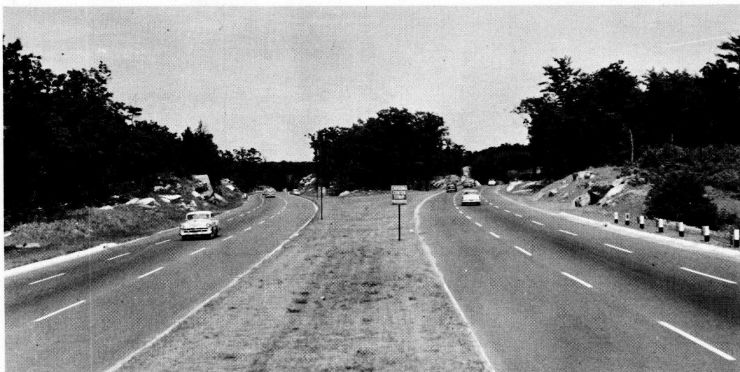
Figure 2. Massachusetts Route 128—Highways such as this one have a pronounced economic effect upon surrounding lands.

Mr. Covey and Mr. Heaney will provide assistance in the interpretation of these cases.