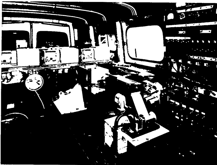
Figure 3. Interior view showing instrumentation in Illinois Division of Highways roadometer van.

A frequent source of trouble recognized by users of the BPR-type roadometer is the mechanical integrator. Extreme care was used in the manufacture of the Illinois integrator, with all parts machined to the closest reasonable tolerances. Careful attention is given to ordinary maintenance of the integrator, and each winter it is completely disassembled, cleaned, and oiled. The behavior of the integrator is believed to be responsible in large measure for accuracy of results.