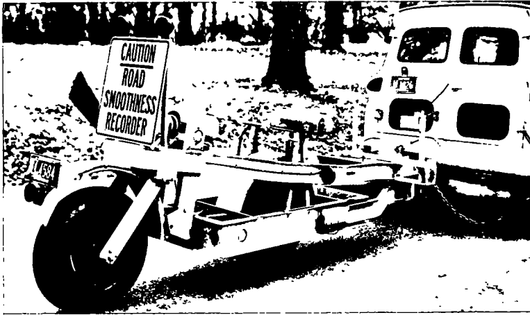
Figure 2. Close-up view of Illinois Division of Highways roadometer and outrigger trailer and van.

The outrigger trailer has an over-all width of about 33 in. and does not interfere with other traffic while the device is recording in the wheelpath positions. A cable hitch is used to raise the roadometer free of the pavement for travel when not in use and for storage. Raising or lowering of the device can be done in a few seconds.