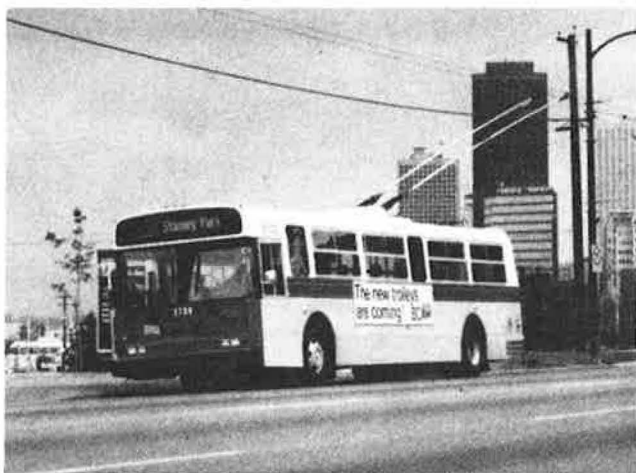
Figure 1. New bus for Vancouver trolley fleet.