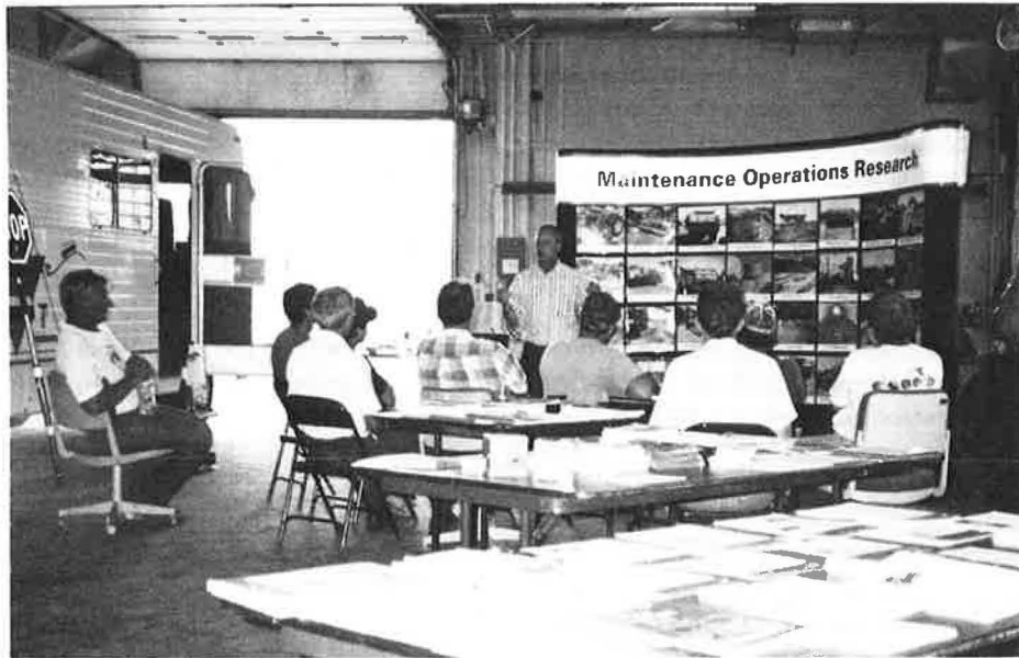
FIGURE 2 An example of a circuit rider workshop presentation.

facilities. By coordinating the Circuit Rider Program through a formal partnership, the workshops can be scheduled to reduce duplication and to increase efficiency benefiting all partners since all neighboring Mn/DOT and local government agencies are invited to attend any given workshop despite the location of the facility.