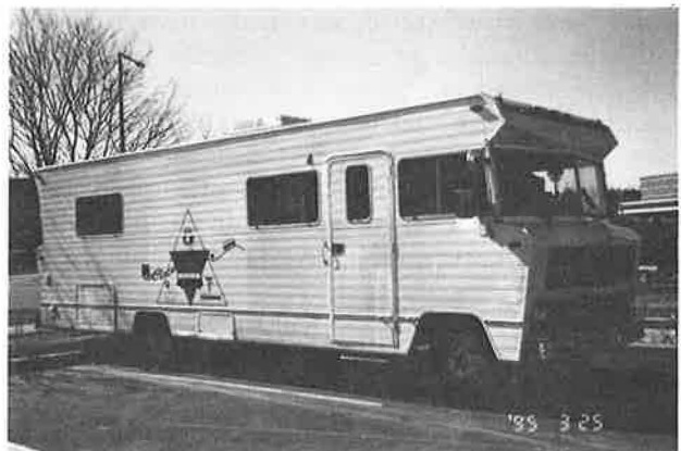
FIGURE 1 Circuit rider van.

During 1996, 50 to 60 scheduled workshops are planned to local government facilities within Minnesota. This training will be provided by Mn/DOT Circuit Rider facilitators, coordinated and advertised by the CTS, and funded by the Minnesota LRRB. In addition to these site visits, similar workshops will be scheduled to Mn/DOT