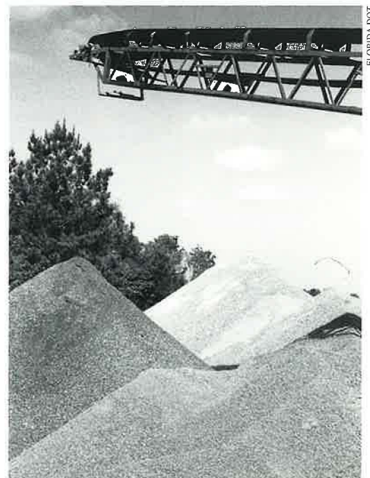
Stockpiled recycled portland cement concrete to be used as aggregate.

Florida's successful programs have been the result of careful performance-based evaluations of materials that were not historically considered engineering materials. When a system is in place that recognizes the potential of waste material and provides for verification of performance through directed research and field trials, what was once considered waste can become a resource and a valued commodity.