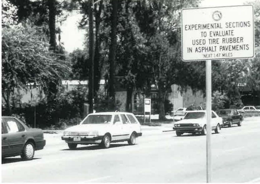
Test section of pavement includes ground tire rubber.

products tested. Materials and systems intended for use in areas with conditions dissimilar to Florida's require additional testing for each specific application. Data and information generated on recycled plastics used by FDOT have been supplied to many other state DOTs, national transportation agencies in several other countries, private enterprises, and environmental organizations.