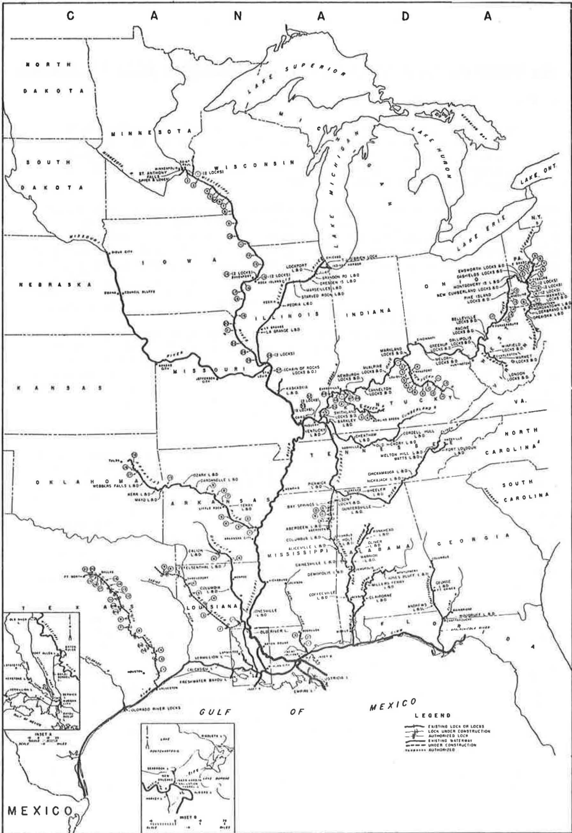
Figure 1. Inland waterways system of the Mississippi River and tributaries.