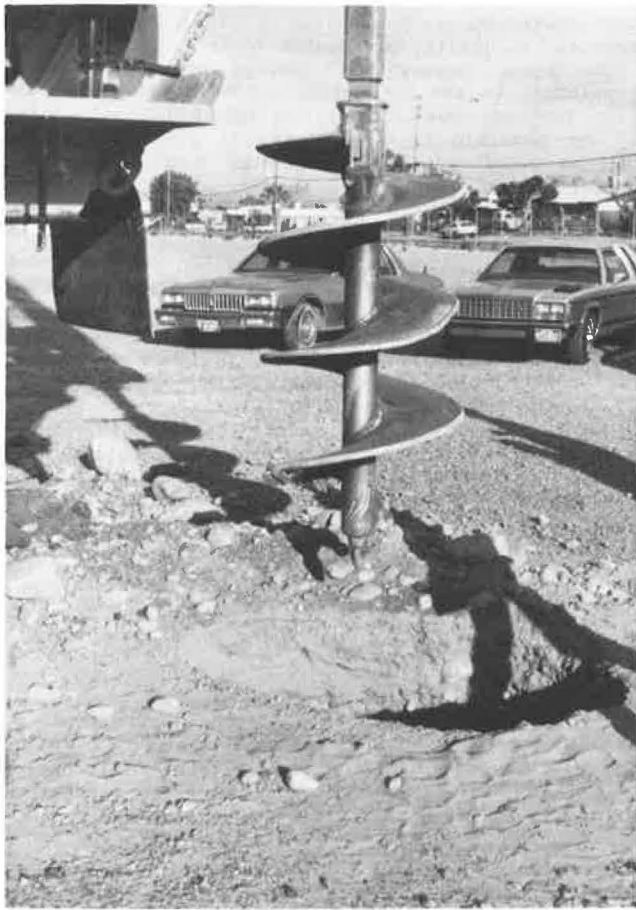
FIGURE 1 A 36-in. helical auger for large observation borings.