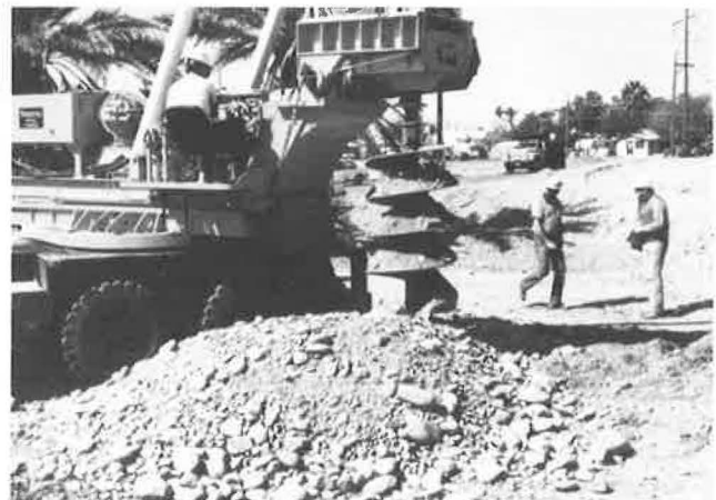
FIGURE 3 S-G-C drilling with a Texoma Tarus holedigger.

Representatives of the contractors, their consultants, equipment manufacturers, suppliers, and construction engineers observed the drilling process with intermittent examination of the side walls during drilling (Figure 3). The borings were planned to penetrate the full depth of the tunnel envelope. Some holes achieved this while others were terminated at groundwater level, but, in all cases, the borings penetrated into the tunnel envelope. A 36-in. corrugated metal pipe (CMP), 16-gauge, protective casing having approximately 8 x 10-in. viewing ports cut at approximately 5-ft centers, staggered at 180 degrees, was positioned in the boring with viewing ports along the tunnel alignment.