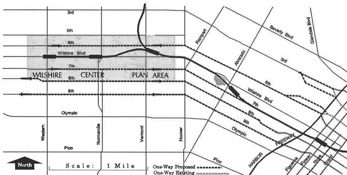
FIGURE 3 Wilshire and Westlake districts.

Do Americans really choose sprawl as the better way to live, as Lowry suggests? Could there be a better choice, or at least alternatives for those who would choose them? Even if sprawl