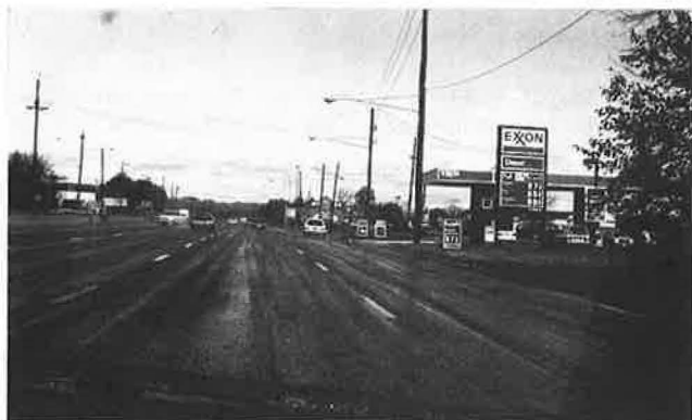
FIGURE 2 Complex environment.