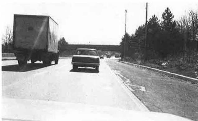
FIGURE 3 Tree blockage.