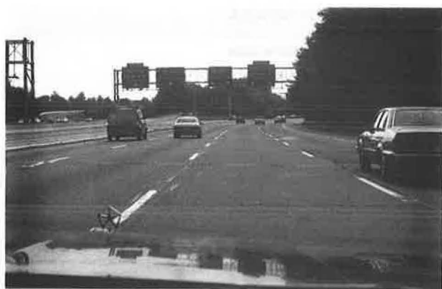
FIGURE 6 Parallel roads.