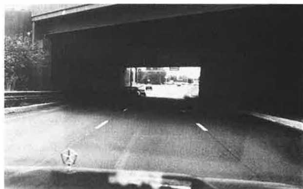
FIGURE 4 Bridge span blockage.