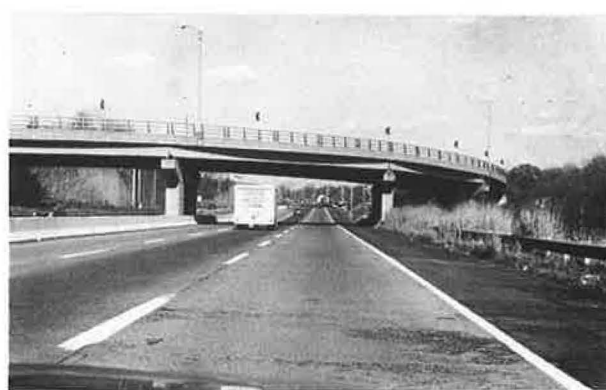
FIGURE 5 Bridge pier blockage.