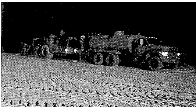
FIGURE 4 Water truck being followed by stabilizer during moisture conditioning of kaolin clay.

the material became so slippery the truck could not maneuver. At that point the farm tractor-pulled rotavator would make a couple of passes to mix the water and clay clods. After this mixing the water truck could make additional passes.