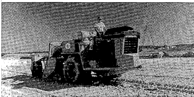
FIGURE 3 Soil stabilizer mixing moisture-conditioned kaolin clay.

Once the clay had been processed so that the maximum clod size was 38 mm (1½ in.) or less, moisture conditioning began. The first method tried was to use a standard water truck with a pump-driven spray bar. Multiple passes were made over the pulverized clay until