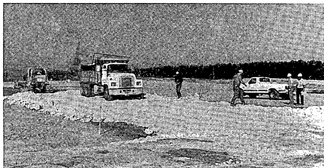
FIGURE 2 A 104-kW bulldozer leveling kaolin clay.

At water contents above optimum the rotavators were not effective because of traction problems. They were therefore not used for final moisture-conditioning operations, but did perform initial blending of raw clay and water.