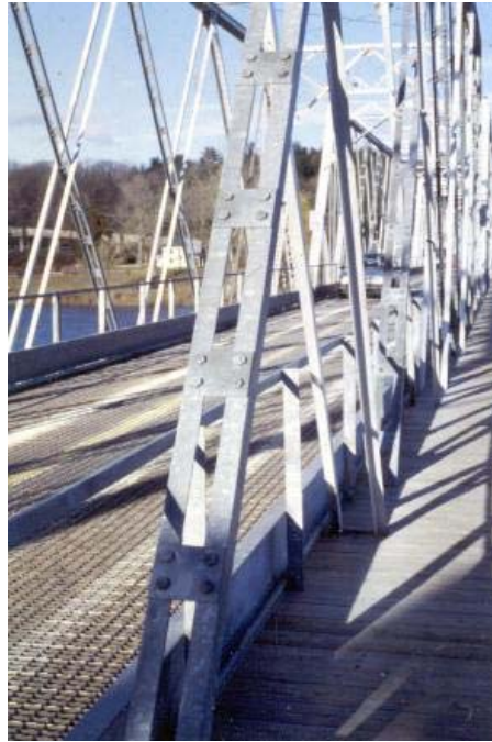
Figure 3. Detail of Delaware River Bridge at Washington Crossing, NJ. Undersized and deteriorated truss members of the 1904 bridge were replaced in kind with higher strength steel to increase the load carrying capacity. Note that the new built up members have high-strength bolts instead of the original rivets. The wood deck was replaced with an open steel grid deck, which also increased load capacity.