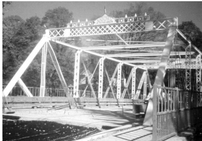
Figure 7. Truss Bridge at Califon, NJ. One of the first truss widening projects in the mid-Atlantic region, the historic 1887 pin-connected through truss bridge located in the Califon historic district was widened from 17' to 24' between the truss lines in 1985 by cutting the trusses and attaching them to the fascia stringers of the new superstructure. While the original flooring system, and thus how the truss bridge worked has been lost, the truss lines support themselves and the original cantilevered sidewalks. The widening was successful because of the original scale of the 100'-long bridge. A 10' widening would not be successful on a 60'-long pony truss bridge. Note how the widening is appropriately expressed in the portal brace.

Bridges with geometry or safety features that do not meet current design standards are classified as functionally obsolete. However, a bridge classified as functionally obsolete because it does not meet current guidelines should not automatically be considered unsafe and in need of replacement. Many functionally obsolete bridges perform adequately. For those instances, a design exception for width should be considered and used if it is appropriate. Design exceptions are based on in-depth studies that include data such as accident history, travel speed, etc., to support using a lesser design criteria. Under certain conditions, a reduced roadway width can be justified.