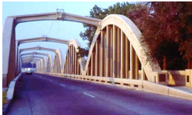
Figure 4. Kansas Corral railings on John Mack Bridge at Wichita, KS. The crash-tested Kansas Corral railings were placed in front of the superstructure on the 1931 bridge as part of the early 1990s rehabilitation. Note how the simple design blends appropriately with the original design of the historic bridge. The original bridge is a Marsh-design steel through arch with a reinforced concrete flooring system and is listed in the National Register of Historic Places.