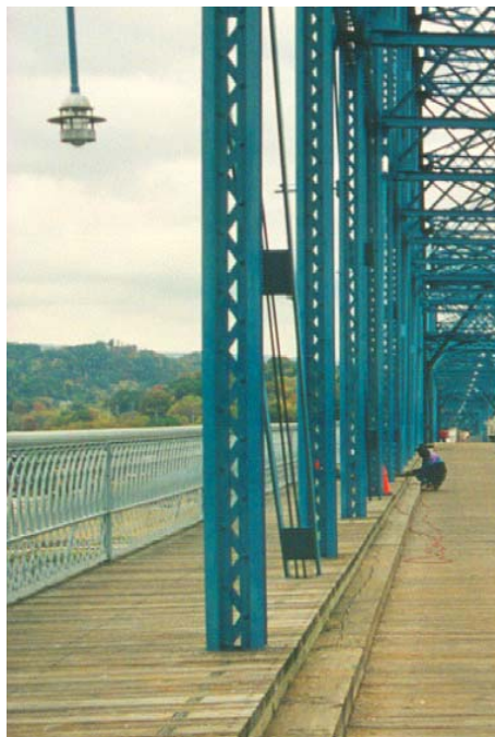
6a. Post-tensioned diagonal.