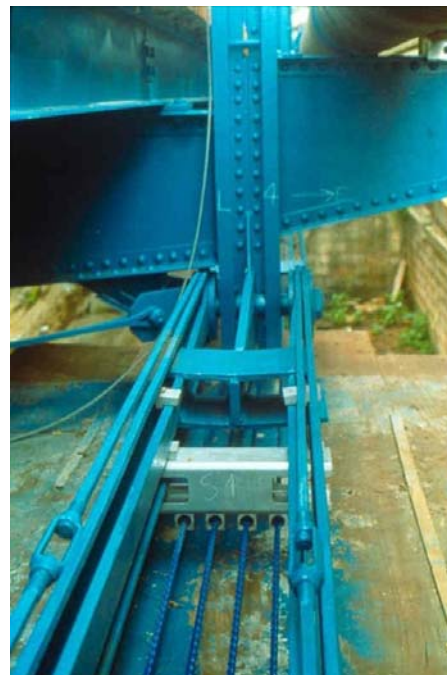
6b. Post-tensioned lower chord.

Figure 6. Walnut Street Bridge at Chattanooga, TN. The 1891 pin-connected bridge was strengthened by post-tensioning the diagonals and the lower chords. Post-tensioning strands can be seen between the eye bars of the diagonals in the foreground of 6a and in a lower chord detail in 6b. Note the original built up floorbeam and cantilever bracket. Photograph by Lichtenstein Consulting Engineers, Inc.