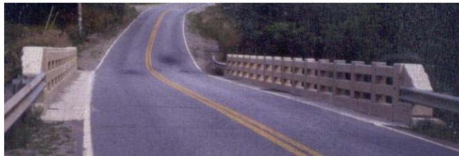
5b. Through view showing modern railings.

Figure 5. Partridge Bridge at Whitefield, ME. The historical significance of Maine’s earliest reinforced concrete rigid frame bridge, built in 1935, was not lost when an appropriate new railing that is sufficiently stiff was placed. The design defers to the original but addresses current safety concerns, including how approach guide rail is attached to the end posts. The railing was designed by the bridge maintenance division of the Maine Department of Transportation.