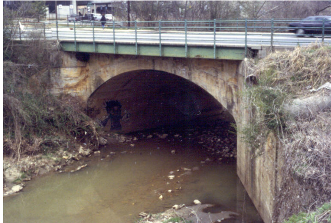
Figure 1. Bankhead Highway over Proctor Creek Bridge in Atlanta, GA. The 1908 bridge is historically and technologically significant because it is one of the oldest reinforced concrete arch bridges in the state. It is the arch itself, not the original railings (removed ca. 1955 when the steel stringer-supported sidewalks were added) that makes this bridge eligible for the National Register. The significant element is below the deck.