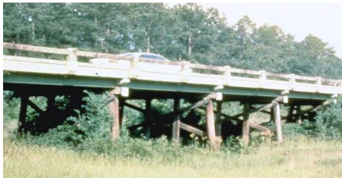
Figure 2. Standard-design 2-span continuous bridge in Georgia. Understanding what makes this seemingly ordinary, 2-span continuous steel stringer bridge significant is crucial to assessing rehabilitation or replacement options. Built in 1931 by the Georgia Highway Department, it represents state standard design that was both innovative and important to modernization of the state highway system. Technically the bridge represents an early national application of continuous beams, which were selected because of the economy. The timber pile bent substructure, cantilevered deck sections, and one-rail high concrete railings also reflect economy of design, making all of the elements part of what makes this particular bridge type and design historic. This means that even the substructure units and the standard-design railings, which are generally not significant features, are in fact significant. Changing them, even if reusing the 2-span continuous beams, would be an adverse effect.