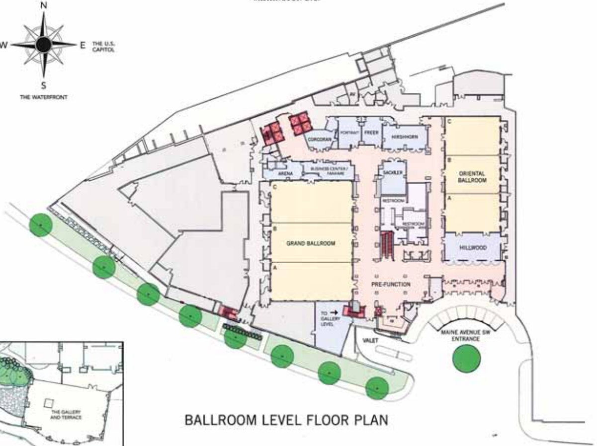
BALLROOM LEVEL FLOOR PLAN