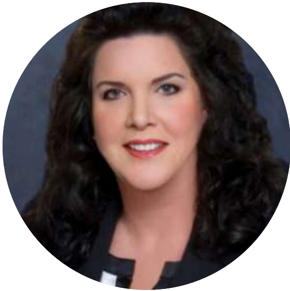
Vice President, Chief Development Officer San Diego County Regional Airport Authority

SAN's electrical load will more than triple in the next 5 years: