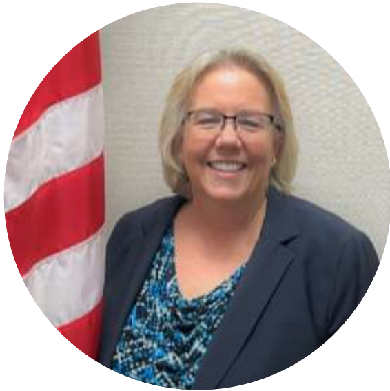
Financial Program Manager Airports / FAA