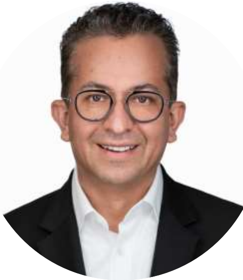
Chief Executive Officer AlphaStruxure