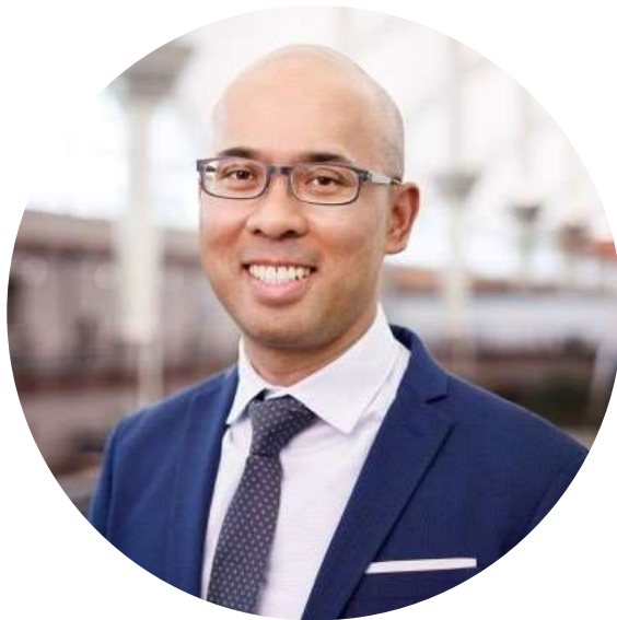
Chief Financial Officer Denver International Airport