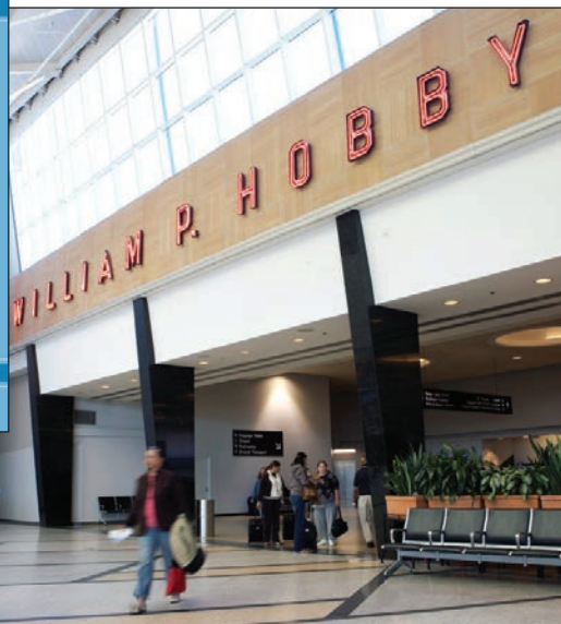
Right: Hobby Airport Terminal.