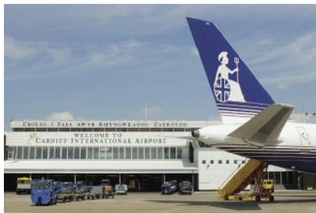
Cardiff International Airport 2

Overall, the role of the Operations Director is to ensure that the safety of Cardiff Airport’s operations are given the highest priority. He is responsible to provide a safe and secure Aerodrome, a robust SMS, and, as Cardiff Airport’s operations grow and change, that it remains a safe airport.