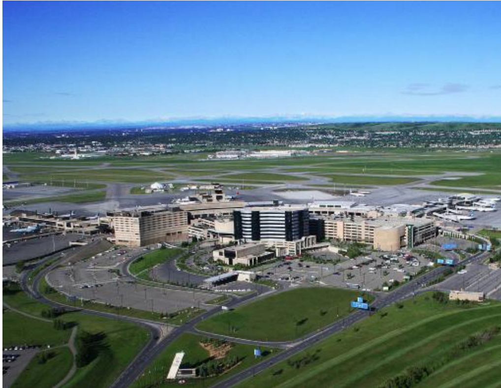
Calgary International Airport

The Director, SMS, is responsible for the implementation of the Transport Canada regulated portion of SMS. In addition, he is responsible for all aspects of safety at the Calgary International Airport.