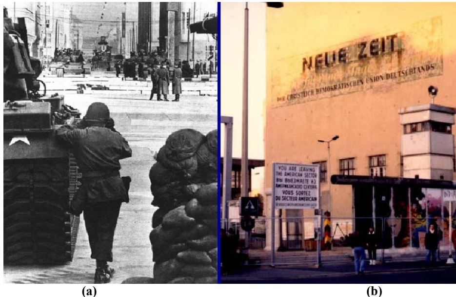
Slide 5 Checkpoint Charlie in (a) 1961 and (b) 1990.

This was the location where American and Soviet tanks stood face to face in August 1961 when the Berlin wall was constructed and the 3rd world war became a reality (Slide 5).