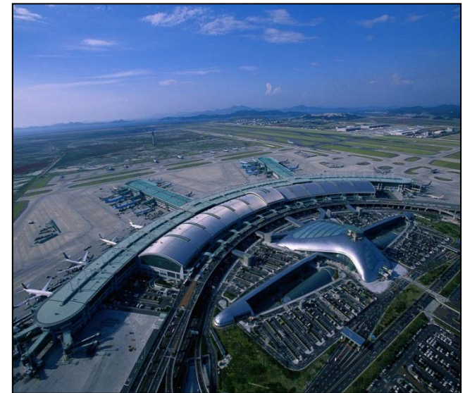
[Incheon International Airport]