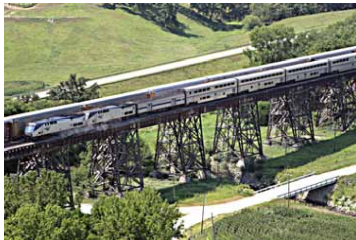
Amtrak's Southwest Chief passes a freight train on the BNSF Railway in rural Illinois. NCFRP Project 30 will help states to screen projects for shared-use passenger and freight rail corridors.