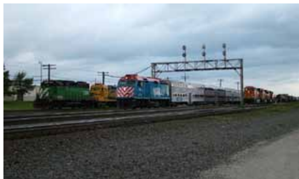
The BNSF Railway's transcontinental main line heading west from Chicago is a high-traffic shared-use corridor, also utilized by Metra commuter trains and Amtrak intercity trains.

In summary, the challenges in developing a successful shared-corridor operation are significant. I am fond of saying that “it is a process, not a project:” the notion of simply buying train slots for a passenger operation—and then walking away—does not work. The good news is that many highly successful shared corridor operations work very well; namely, systems in places such as Chicago, Illinois; North Carolina; and California. NCHRP Report 657 will point the way for those seeking role models to develop their own new services.