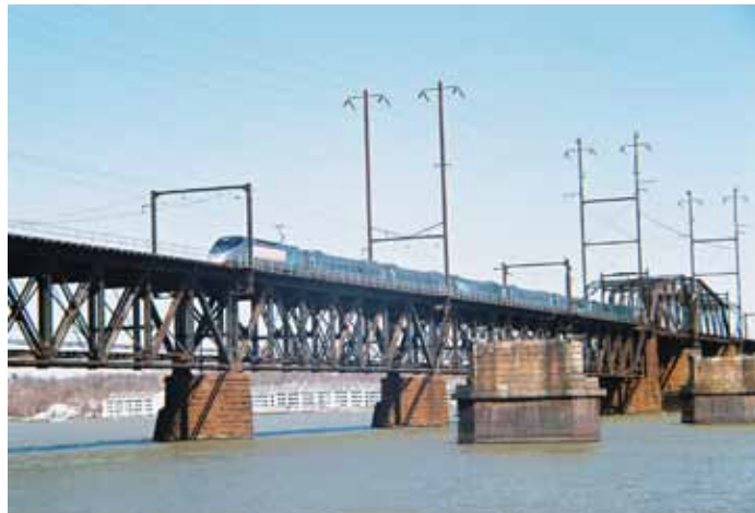
A high-speed Acela Express train crosses the Susquehanna River Bridge in Maryland.