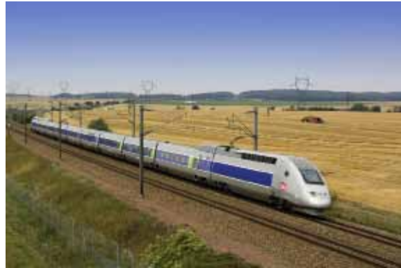
The TGV East network brings high-speed rail to many different locations in France and Germany.

Opting for HST over conventional rail means service to fewer cities and stations and more expensive service from which fewer people can benefit. Even with HST, aircraft and cars are the preferred or only option for too many people.