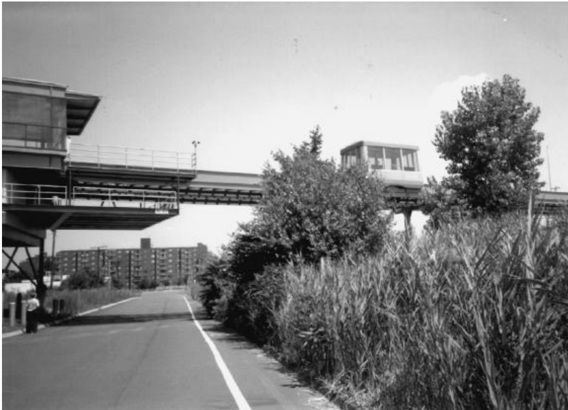
FIGURE 3 APM shuttles have much smaller dimensions than conventional rail transit and can fit comfortably into existing activity centers.