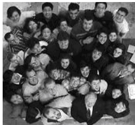
Figure C3.1-3—Live Load of 150 psf