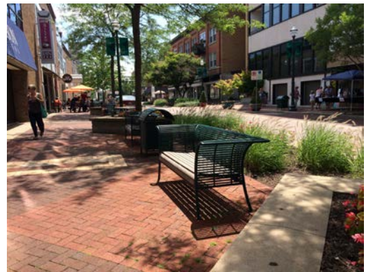
Research on the economic impacts of pedestrian improvements is less common