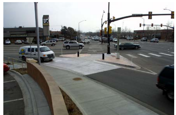
Raised pedestrian crosswalk at a channelized turn lane.