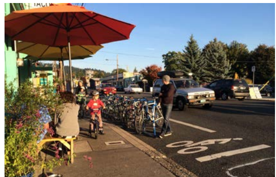
An on-street bike parking corral outside of a restaurant