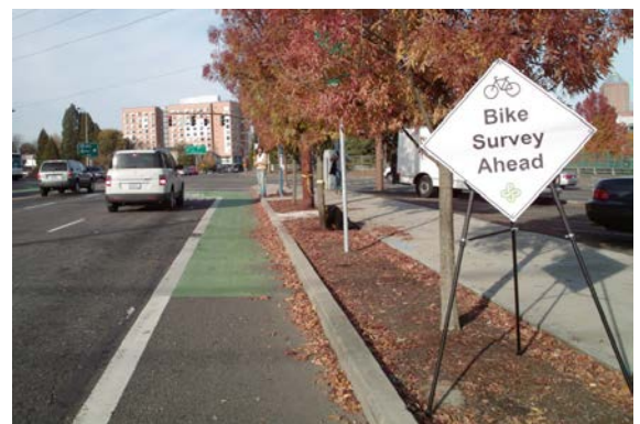
An intercept survey for bicyclists.