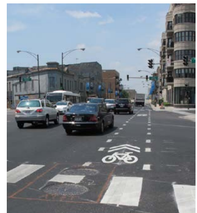
Bike lane extension through an intersection.