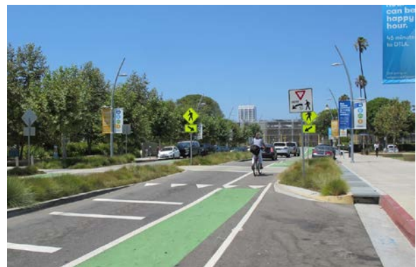
A crossing in Santa Monica, CA, combined a curb extension and median refuge to shorten the crossing distance