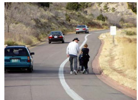
Pedestrians using a shoulder along a roadway.