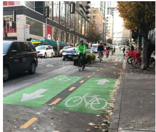
A two-way separated lane in downtown Seattle with green paint at a driveway.

NCHRP 766 report included several remaining research gaps on bike lane widths (Torbic et al., 2014).