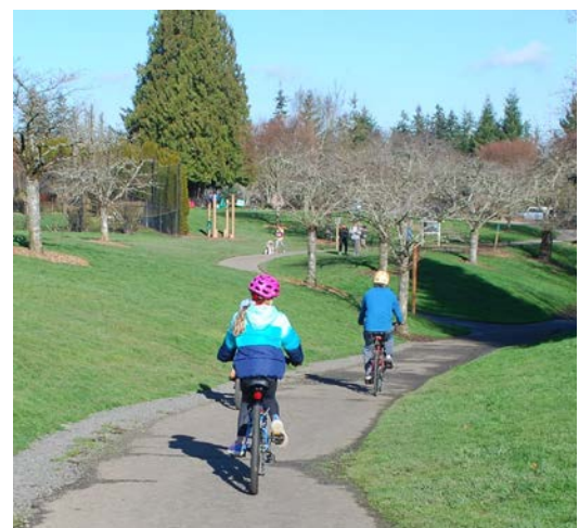
Active transportation infrastructure can lead to health benefits from increased walking and bicycling