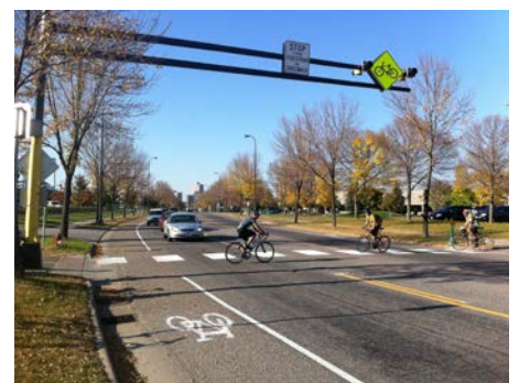
A shared-use path crossing in Minneapolis.