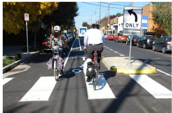
A striped bike lane in Portland, OR, with a buffer for the door zone.