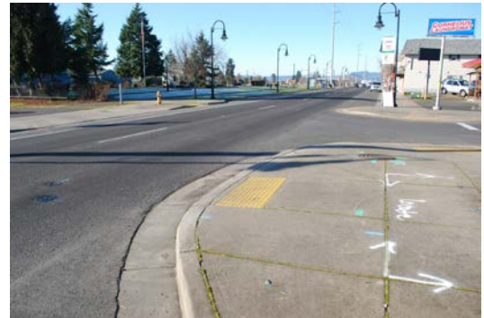
Curb extensions along a major arterial in Cornelius OR reduces pedestrian crossing distances.