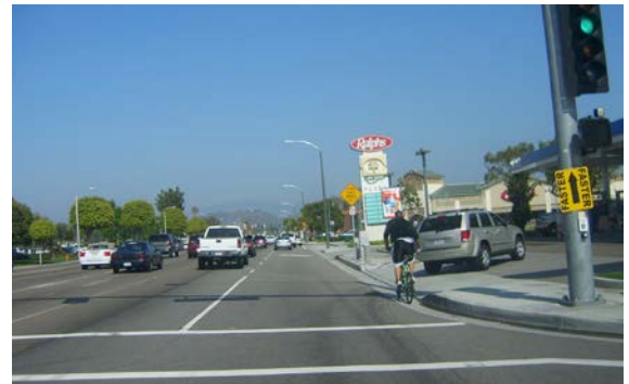
Access management includes reorganizing or removing driveways to reduce the number of conflict points.

Right-turn lanes for driveways offer the potential to slow down turning traffic but may have a negative impact on pedestrian safety due to wider crossings.