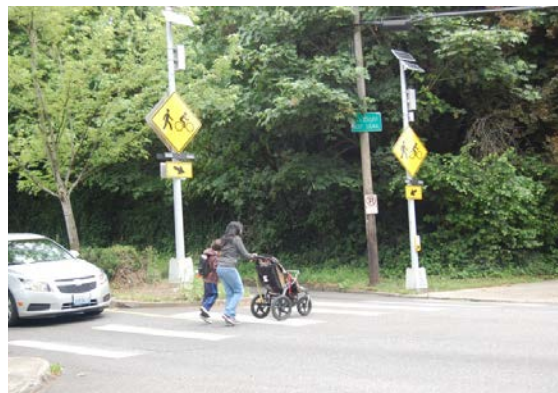
A pedestrian-activated rectangular rapid flash beacon at a marked crosswalk.