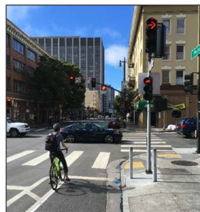
Intersection with bike signal and phasing.