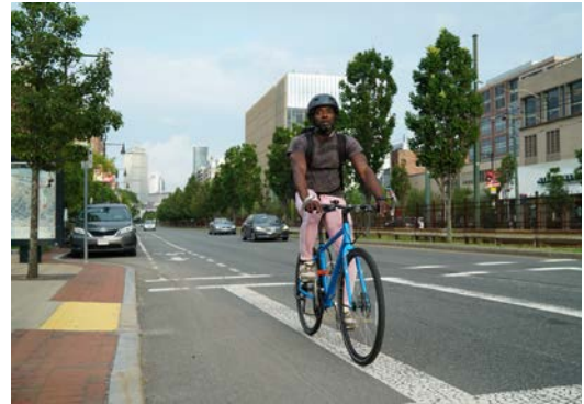
The rate of bicyclist traffic deaths vary by race and are higher among Black people