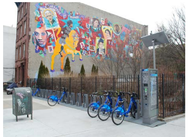
A bike share station in Brooklyn, NY.

Top barriers to bike share include cost and knowledge about how to use the system, along with concerns about riding in traffic (Fishman, 2016; McNeil et al., 2018).