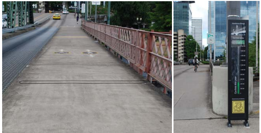
People bicycling across a bridge in Portland, OR, are counted when they cross the tube, with the count displayed on a sign at the end of the bridge.