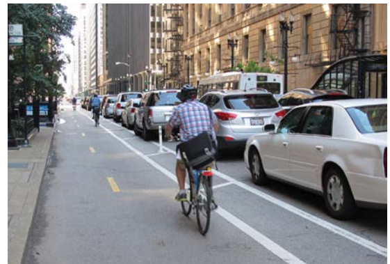
A parking-protected bike lane in Chicago, IL.