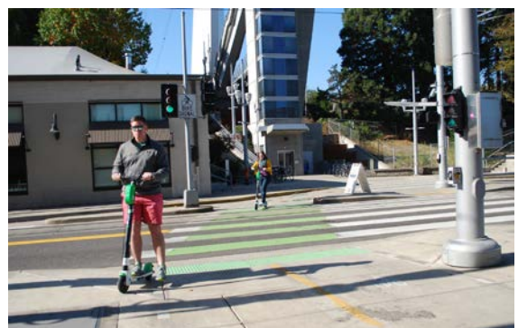
E-scooter riders using active transportation infrastructure.