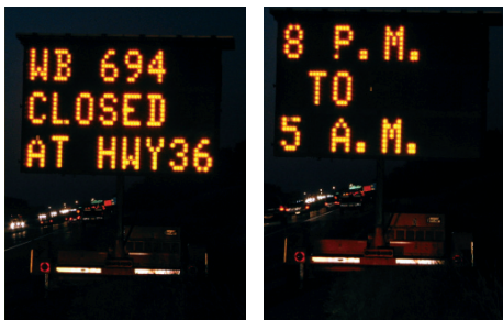
Two-phase closure message on a changeable message sign