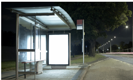
Pavements, luminaires, transit facilities—all transportation assets can benefit from the guide's management methods.

"In the early 2000s, Maryland DOT staff responsible for these other areas didn't have a lot of experience with asset management, so this guide helped them understand the principles of asset management and how to apply them," he adds. "Across our agency, we are enthusiastically using the guide to expand our asset management framework. It helps us make decisions on when and how to extend the life of existing assets or put new ones in place."