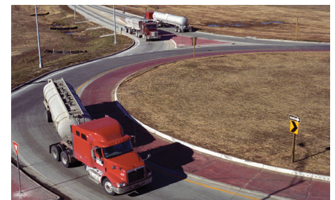
Large freight vehicles were a design consideration for a roundabout in Florence, Kan.

For more information about this NCHRP research or to download these reports, please visit www.trb.org/nchrp .