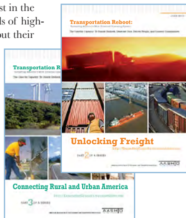
Study 52 was the basis of strategic tools addressing different aspects of capacity.

sometimes seem lost in the overpowering needs of high-population areas, but their transportation and production networks actually serve the entire country,” he says. “The Interstate system is aging, yet it is absolutely vital to the health and security of the country. The system will need to be a priority for future funding, as the report points out.”