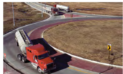
Large freight vehicles were a design consideration for a roundabout in Florence, Kan.

For more information about this NCHRP research or to download these reports, please visit www.trb.org/nchrp .