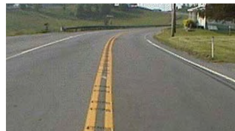
Iowa drew from NCHRP Report 641 in developing designs for shoulder and centerline rumble strips.

Younie finds NCHRP syntheses of state practices particularly valuable. " NCHRP Synthesis Reports do a tremendous job of capturing the national state of practice," he says, "and show us how well Iowa is aligned with practices in other states."