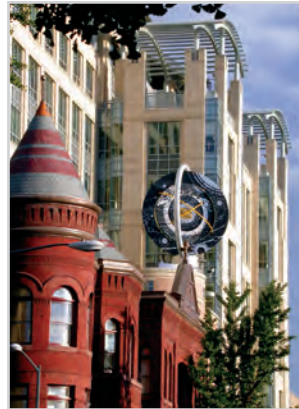
TRB is headquartered at the Keck Center of the National Academies, 500 Fifth St. NW, Washington, D.C.

Once research starts, administrative and technical oversight of progress is performed by NCHRP staff, consisting of 16 full-time employees assigned exclusively to NCHRP and 20 additional employees who split their time among all of the TRB cooperative research programs. In-depth oversight by project managers with wide-rang-