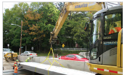
A hybrid-composite beam is lowered into place as a New Jersey bridge takes shape. The NCHRP IDEA Program (Project 20-30) helped put the innovative new bridge beam concept into practice.

In addition, HC Bridge Company, LLC, and three partner organizations (including TRB) won the 2013 Charles Pankow Award for Innovation for their hybrid-composite beam (HCB). The NCHRP IDEA Program provided partial funding for the manufacturing and testing of a prototype HCB bridge for railroad and highway applications. The HCB weighs one-third as much as concrete beams and can hold 50 percent more weight. Presented annually by the American Society of Civil Engineers, the Pankow Award recognizes the contributions of organizations working collaboratively to advance the design and construction industry by introducing innovation into practice.