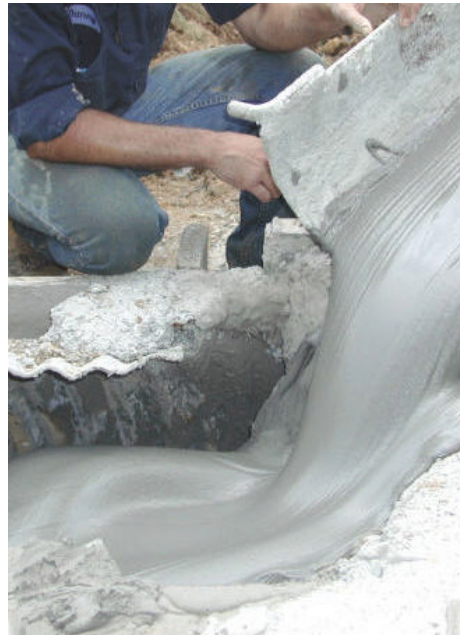
Flowable fill is self-leveling and self-compacting. It requires less labor than traditional fill materials.

However, significant effort was still needed to put the findings into practice among