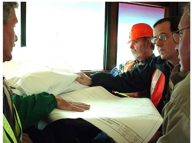
Indiana DOT's Pavement Steering Committee serves as a forum for agency practitioners to evaluate how NCHRP findings may meet the state's needs.