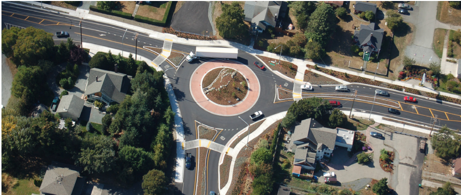
Roundabouts, which help increase safety and reduce congestion, are becoming more common in the United States through the implementation of NCHRP Project 03-65.

Roundabouts clearly provide safety and mobility benefits, yet some transportation agencies in the United States have been slow to adopt them. NCHRP research established foundational knowledge on roundabout safety, operation, and design that has driven a surge in their use nationwide.