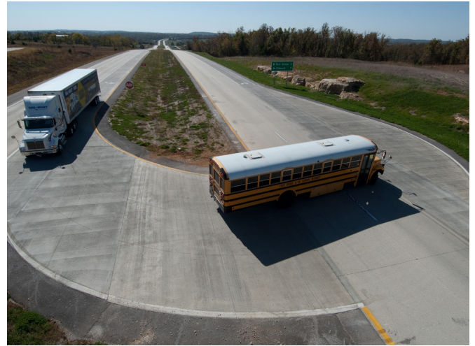
Some J-turn treatment U-turn designs involve bulb-outs to accommodate larger vehicles.

“We’ve seen a 90 percent reduction in angle crashes where we’ve installed J-turns.”