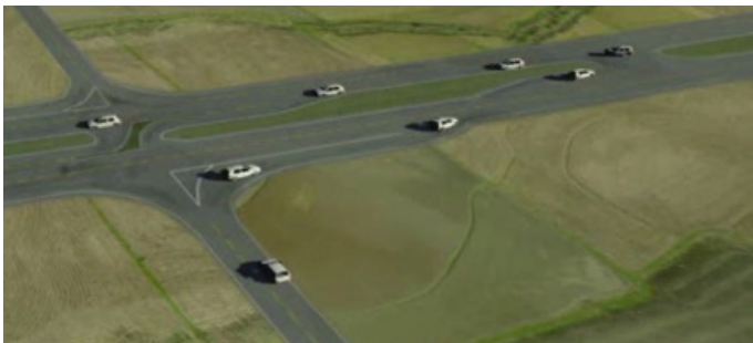
J-turns significantly improve rural highway intersection safety by preventing drivers from directly crossing medians and requiring them instead to make a right turn followed by a U-turn.

Median-separated highways provide distinct advantages over undivided roadways by separating traffic, providing a recovery or stopping area for vehicles, and providing space for left-turn vehicles. In many cases, they also provide the same safety and travel time benefits as rural interstates at a lower cost. However, these safety benefits can be diminished by an increase in the frequency and severity of intersection crashes, especially right-angle crashes that occur while a vehicle from a minor road is making a left turn through the median and onto the highway.