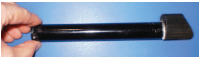
Visible Asset Inc.'s long-range RFID tag

The tools being tested include a seismic reflection locator, an active/passive acoustic locator, long-range radio-frequency identification (RFID) tags, and a scanning electromagnetic (EM) locator. The seismic system targets all pipe materials, is staged completely above ground, uses shear waves to resolve smaller targets, and works in clay soils where ground-penetrating radar does not. Its current seismic techniques are suited for large and deep targets. The acoustic locator can target any pipe material and improves discrimination among facilities. The RFID tags have a range of up to 40 feet with a hand-held reader, a battery life of 20+ years, and IEEE 1902.1 public protocol communication. The EM locator uses low-frequency EM for depth of penetration; however, unresolved signal-strength issues are delaying testing and it may be dropped from the testing program. The technologies advanced in this project expand the ‘locatable’ zone of deep utilities with improved reliability. This location data eliminates delays when transporta-