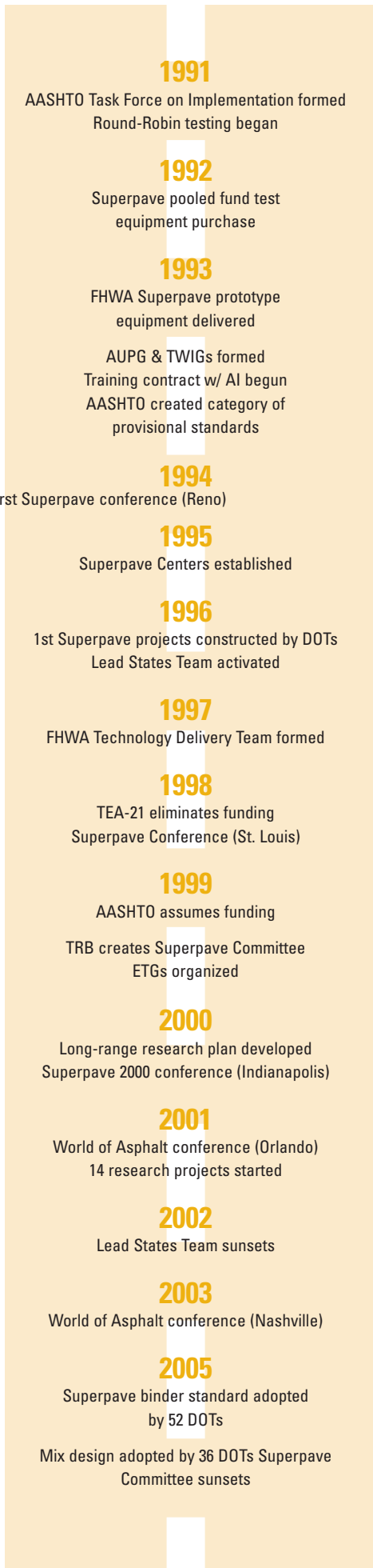
FIGURE 1: SUPERPAVE IMPLEMENTATION TIMELINE

necessarily brief, it will only offer highlights from the deployment campaign. This is doubly hazardous. Aspects of the campaign critical to its success will go unmentioned and the contributions of many organizations and hard-working individuals will go unacknowledged. Furthermore, lessons to be learned from the innovative techniques used in this campaign may go untaught and the innovations themselves lost to future technology deployment efforts. For these reasons, the members of the TRB Superpave Committee have recommended that the full “history” of Superpave development and deployment be captured for future study. (The recommendation is made in the Committee’s 11th letter report to the Federal Highway Administration and the American Association of State Highway and Transportation Officials, which is on the Web at http://www4.trb.org/trb/dive.nsf/web/superpave_final_letter_reports )