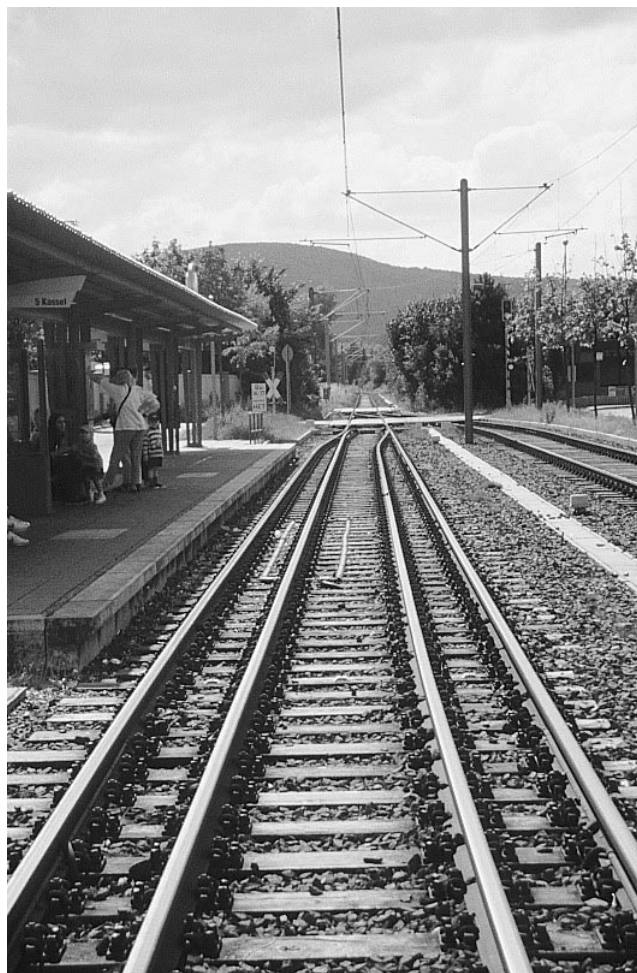
Figure 7. "Gauntlet track" system at a station on Baunatal shared-use railway line in Kassel. Automated equipment with entered codes aboard the LRV signals the switches to select the tracks nearest the platform.

triple-voltage railroad rolling stock crossing international borders. EU will promote continuance of multiple voltage equipment, and it is, therefore, technically realistic to apply it to equipment that shares tracks and overhead catenary traction currents. This is a nonissue in North America, where electric traction on railroads is a rarity. The DMU or dual power (electric and internal combustion) becomes the equivalent way of powering a rail car that must operate under streetcar wire and independently with on-board generated power when on railroad track.