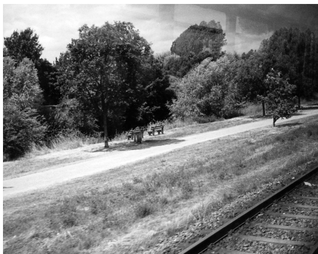
Figures 12 and 13. A wide variety of bicycle and pedestrian pathways run adjacent to urban and rural rail lines (Cologne and Karlsruhe).