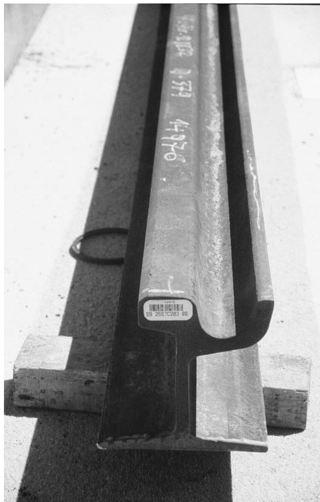
Figure 3. End view of new rail being installed at Saarbahn line extension in Saarbrücken. Note deep flangeway, which accommodates standard railroad wheel flange.

radius streetcar curve. Those DMU models equipped with electric transmissions have more flexibility, yet only a few models can negotiate down to a 130-ft radius. This was a major consideration in NJ Transit selecting a DMU model for its Trenton Camden diesel light rail service.