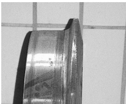
Figures 1 and 2. Karlsruhe special wheel profile with flange modified to be compatible with street rail and railway operation. Picture of wheel at bottom is from Karlsruhe maintenance shop.