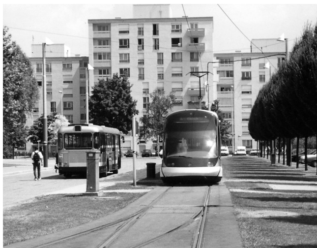
Figure 11. Strasbourg trams and tracks provide a highly visible “homing device” for sightseers and tourists confused by complex bus routings.