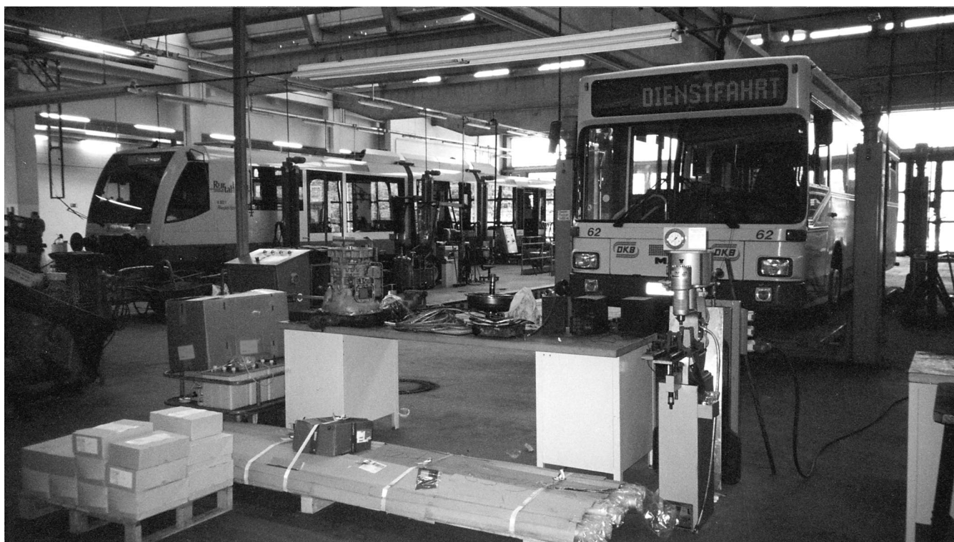
Figure 8. Joint bus and tram maintenance facility in Dueren.

In response to these common afflictions of smaller German (and U.S.) cities and counties, Dueren created a countywide improvement authority to preserve and operate essential public services including rail branch line operation (and therefore jobs in wayside industries). Bus service had already been absorbed and integrated at the county level by the authority. Dueren’s similarity with U.S. counterparts diverged when it entered the rail passenger business. A rail passenger operating entity (Duerener Kreisebahn or DKB) was formed as part of the county bus system. Initially rail buses or “schienenbus” were used to provide modest service over the two nonelectrified railroad branch lines. Later, modern Siemens “Regio-Sprinter” cars replaced the schienenbus. One of these Regio-Sprinters, now in Dueren, was used on a demonstration tour of the United States and Canada in 1997-1998. These low-floor cars were ridden by the study mission and their features demonstrated during the mission’s visit to Dueren. The introduction to DKB of these light rail-derived, low-floor, bus-engined rail cars was deferred until the German federal regulatory authorities