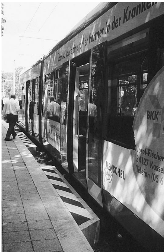
Figure 6. Kassel LRV stops at platform with highlighted extensions to bridge car-platform gap. Extensions are stationary. Paint treatment is to highlight safety awareness. Cars have deployable ramps for wheelchair access.