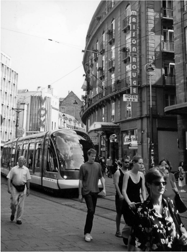
Figure 9. Strasbourg's city center is reserved for pedestrians and trams.

planners determined could be met only by augmenting the bus system with a new LRT system (buses could only divert about 3 percent of automobile users). Similar to many U.S. towns and cities, Saarbruecken's original meter gauge tram system had been dismantled in the mid-1960s.