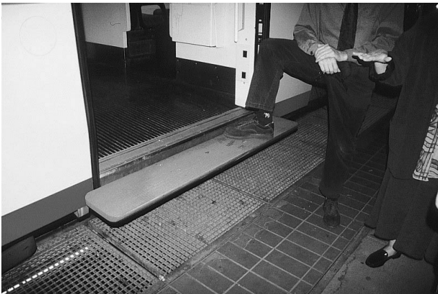
Figure 4. Karlsruhe LRV with two-height retractable steps deployed at higher level for high platforms.

German streetcar traction voltages run between 600 v DC and 760 v DC. Railroad traction currents in Germany are standard at 15 kv AC. Other western European railroad voltages most commonly are 750 v DC, 1500v dc, 25kv AC. This presents a challenge to sharing track, but it is a dilemma that has already been addressed and resolved with dual- and