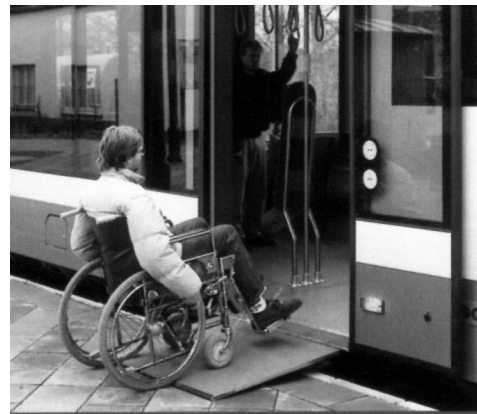
Figure 5. Picture from Duren brochure shows use of deployable wheelchair ramp.