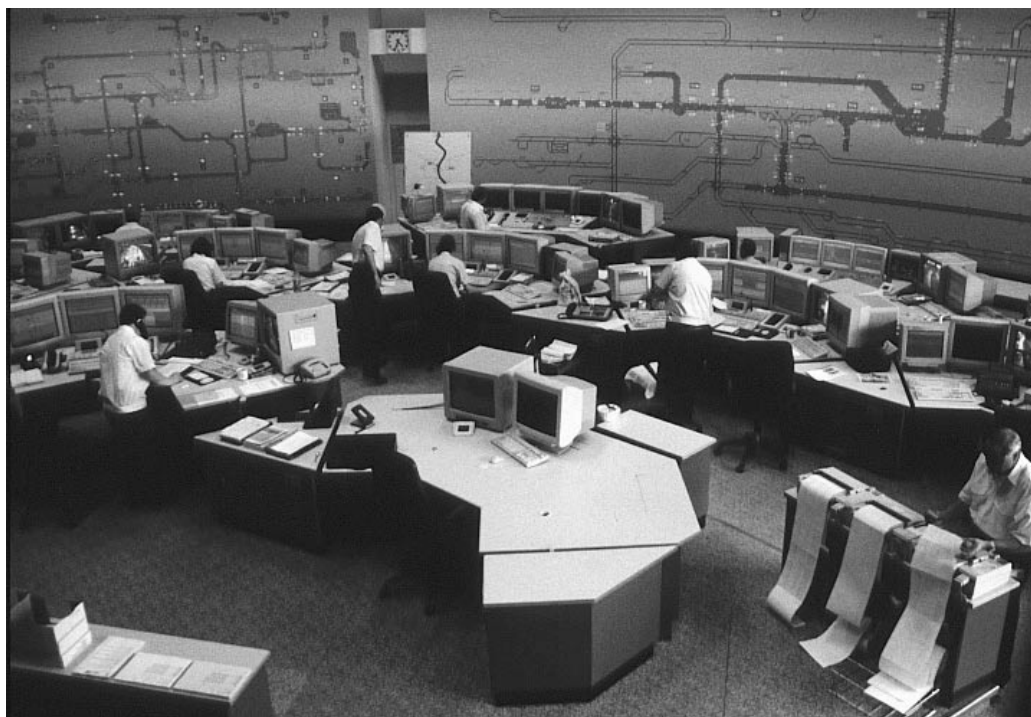
Figure 15. Cologne Control Center unifies right-of-way dispatch, voice communications with LRV's and buses, and security functions.