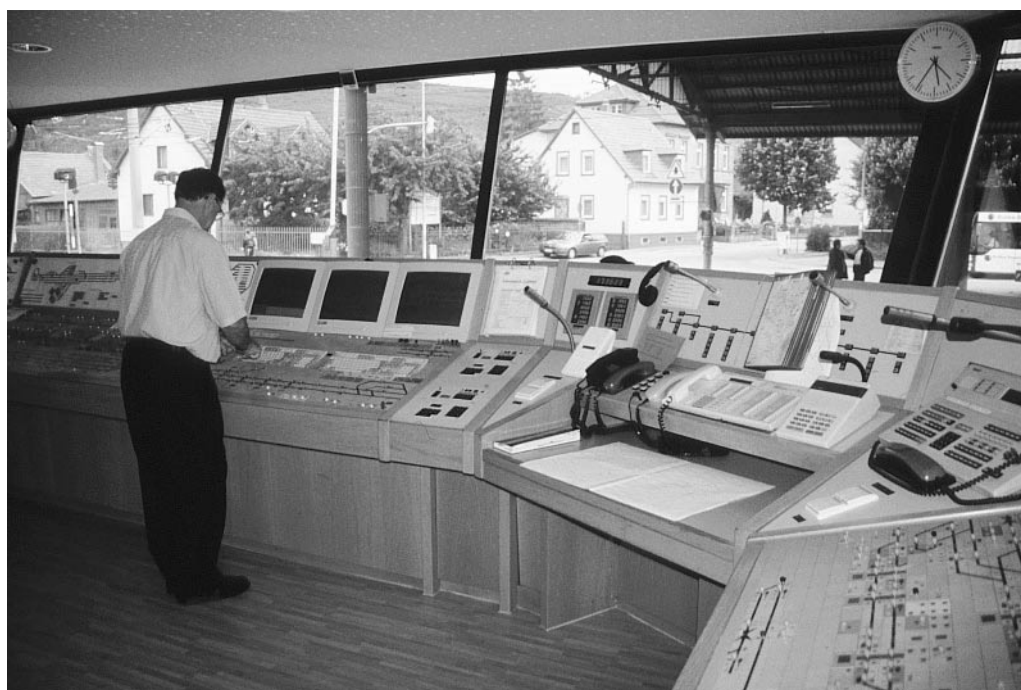
Figure 14. Ettlingen Control Center in Karlsruhe which controls SI and SII LRV joint-use lines.

The use of the tram-train concept or Karlsruhe track-sharing model appears to demonstrate these study mission-observed ideals dramatically. In spite of the successes noted in the seven overseas shared track cities visited, there are realities that must be considered in any initiatives to adapt German railway practices in North America.