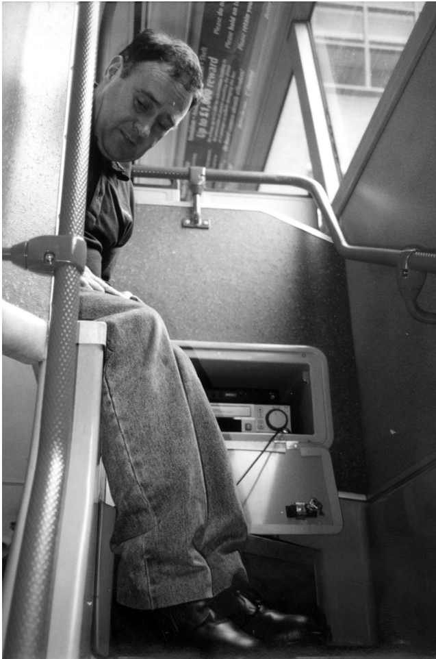
Figure 3. Translink's onboard video cameras and recording devices, which allow the driver to monitor the lower and upper decks of the bus, have been fairly effective in reducing vandalism.

There are no cubbyholes or other space between the seats. Not only does this make the bus easier to clean, but it also means there is no place to hide packages. The cantilevered seats are placed tight against the vehicle wall to discourage pickpockets.