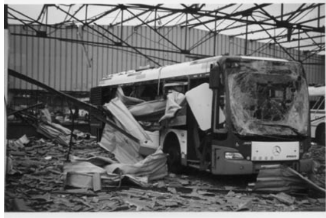
Figure 2. More than 100 SEMVAT buses were destroyed by the explosion at the chemical plant adjacent to its Langlade Bus Depot.

At 10:17 a.m. on September 21, 2001—just 10 days after the terrorist attacks in the United States—there was first one explosion and then another at a fertilizer chemical plant in Toulouse, next to SEMVAT's Langlade Bus Depot. These explosions caused total panic throughout the city as everyone assumed it was a terrorist attack. There were vapors in the air that people feared might be toxic. Everyone tried to leave town at once. Regular telephone service did not work; only mobile phones were effective. Fire and police personnel had a very difficult time reaching the scene of the explosions, taking an hour to get there and organize the response. The Langlade Bus Depot, which also housed SEMVAT's administrative headquarters, and more than 100 SEMVAT