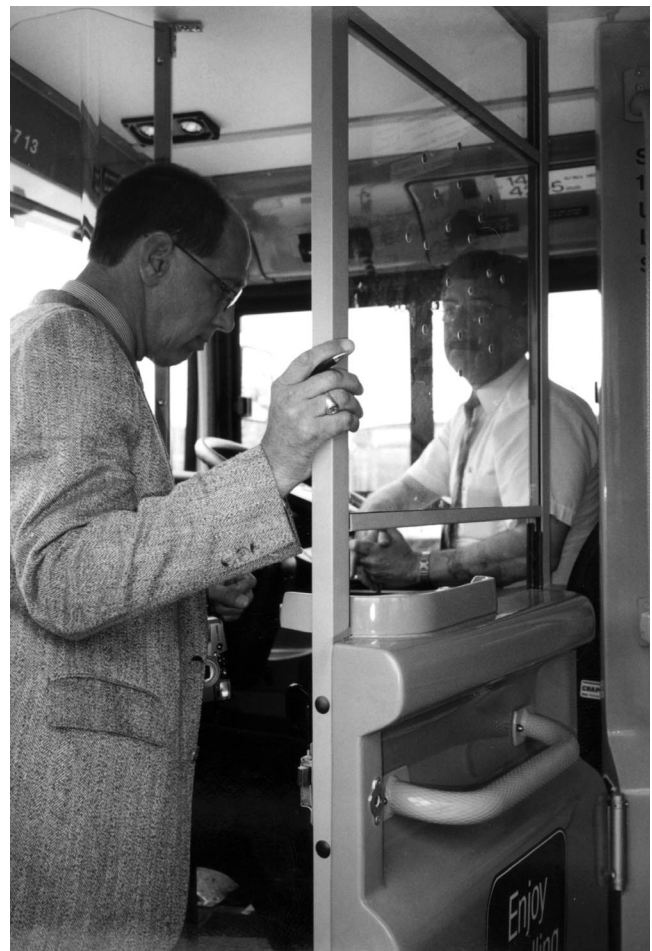
Figure 5. The drivers on First Mainline buses in Sheffield, UK, are separated from the passenger compartment by an anti-assault door and screen.

The First property in Sheffield took similar security measures, such as separating bus drivers from the passenger compartment by an anti-assault door and screen (see Figure 5).