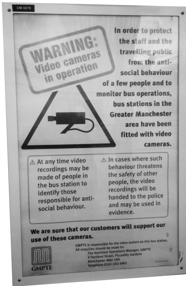
Figure 4. The Greater Manchester Public Transport Executive makes widespread use of video cameras in its bus stations.

this use (see Figure 4). The city was also actively pursuing global positioning system (GPS) options to identify the locations of vehicles in trouble.