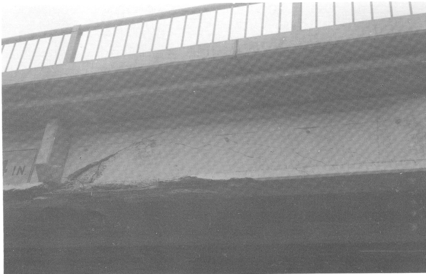
Exterior girder of damaged prestressed concrete bridge, Hiawatha Valley, Washington.

many bridge engineers have little experience in repairing prestressed concrete. As a result, damaged girders that could, in many instances, be repaired in place have been removed and replaced with new members at considerable cost.