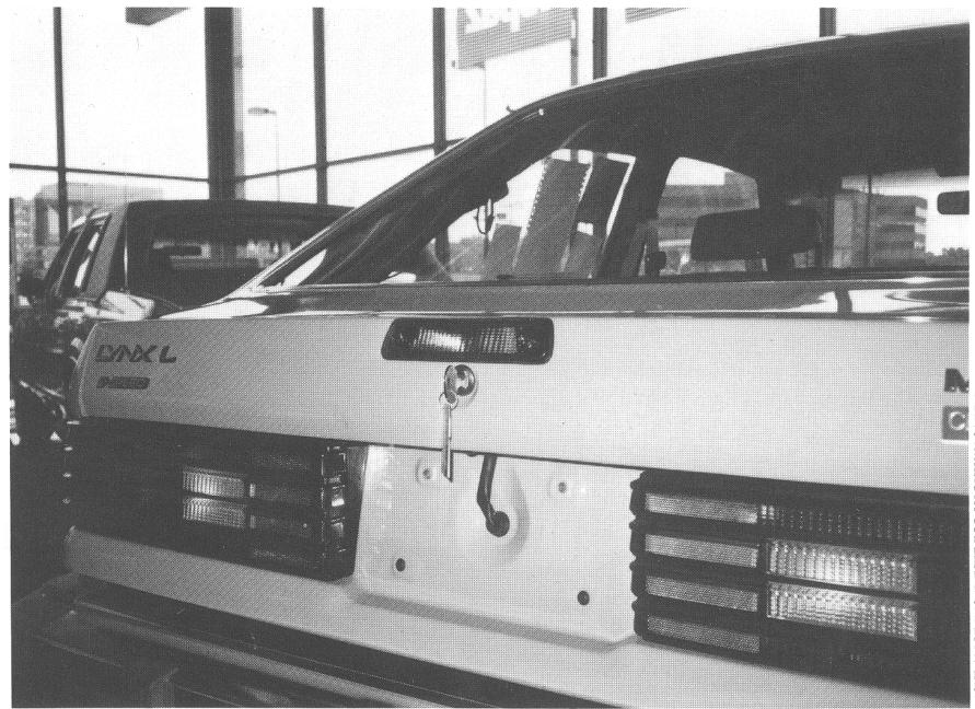
Center high-mounted stop light on 1986 Mercury Lynx L.

On the basis of the field studies, NHTSA researchers estimated that some 900,000 of the 4,000,000 rear-end crashes each year could be eliminated by using CHMSLs. The savings gained from this 22 percent reduction were estimated at $434 million per year for car repairs alone. Costs of the new lamps were assumed to be $15 per car at first and $4 per car as production increased. This latter cost produced an estimated yearly expense of $40 million, giving a savings of close to $400