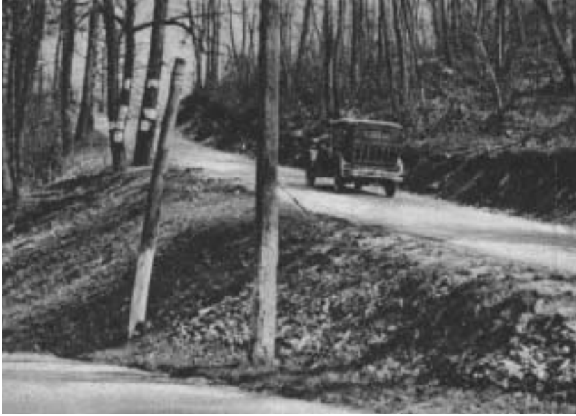
From Paige-Detroit Motor Car Company brochure: Paige Phaeton climbs Uniontown Mountain, Pennsylvania, reaching a speed of 30 mph at the summit.

A farmer hitches a team of horses to rescue a car stuck in the mud on a rural road, circa 1920.