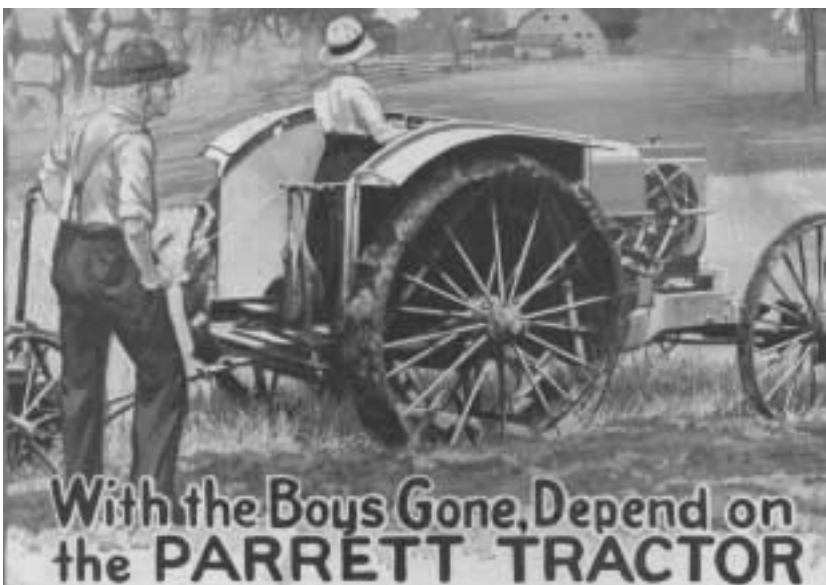
Advertisement circa 1917 illustrates the need for farm tractors, with soldiers (and farm horses) marching off to World War I, leaving the elderly and women to ensure the nation's food supply.

unchanged: "By 1925 over two-thirds of the new cars purchased each year were bought on credit" (2).