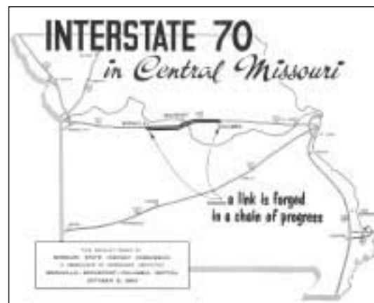
Cover of booklet celebrating the dedication of the Boonville-Rochepport-Columbia, Missouri, section of Interstate 70, October 1960.

In the 1950s, farm equipment manufacturers, faced with declining sales, expanded into road build-