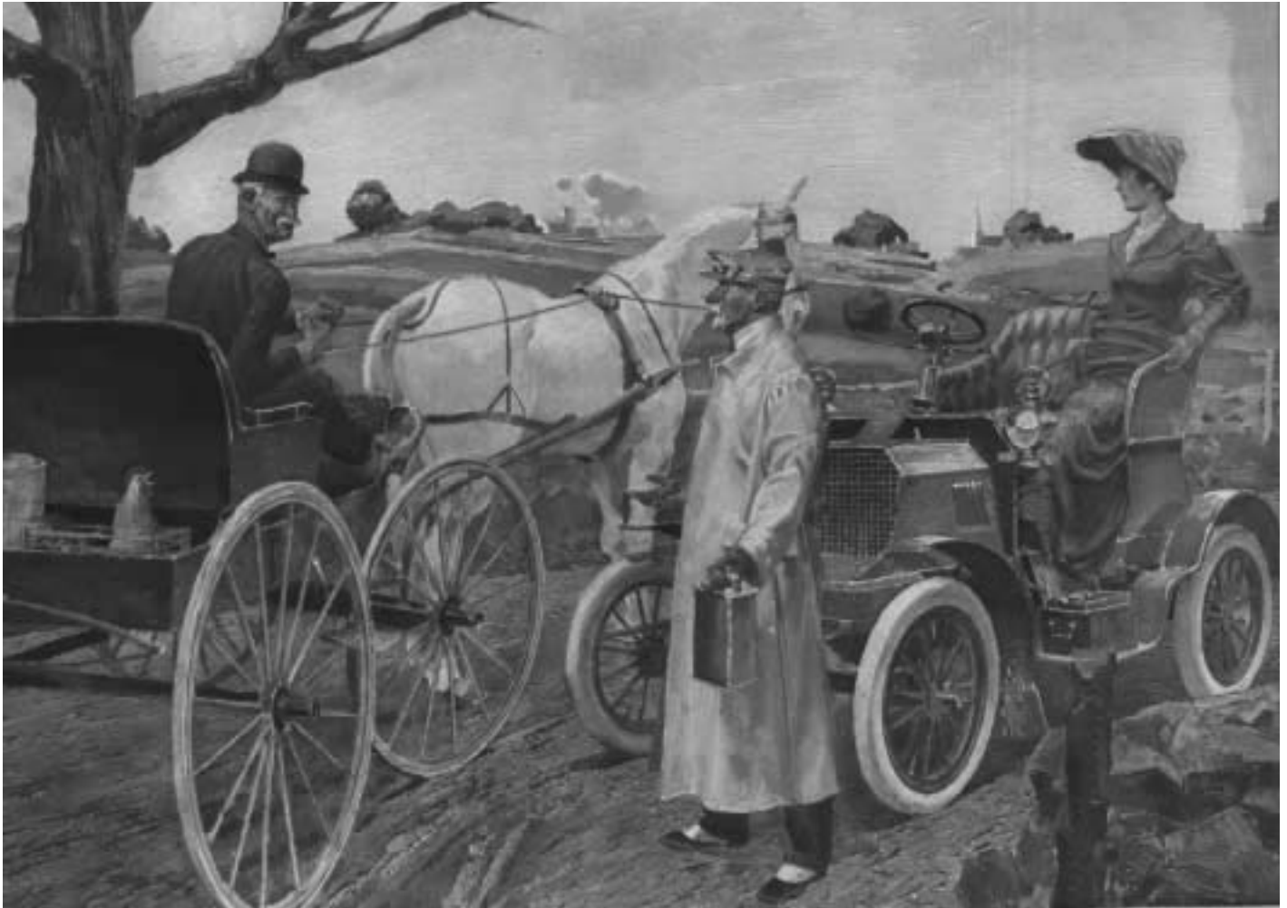
Illustration from a 1935 Gulf Refining Company ad, depicting the plight of a 1901 automobilist: "Gasoline? Mister, there's not a drop for miles."