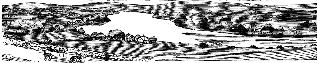
Rural motoring graphic from Motor Travel: A Magazine for Automobile Owners , February 1926.

Yes, bridge, we believe in you. You symbolize strength and epitomize progress. You are emblematic of enterprise. Thus far our acme of achievement, you are to continue our greatest urge to action. "Forward," not finished, is our watchword.