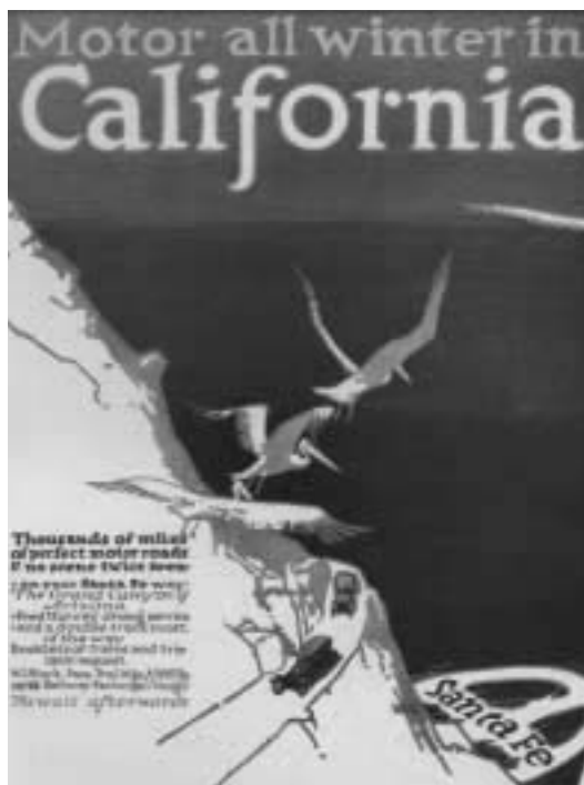
Santa Fe Railway ad promoting tourism by train and automobile, from St. Nicholas magazine, December 1917.

In the early 1900s, long-delayed road and bridge projects that had failed for lack of financing were proposed again under the promise of the new, automobile-centered prosperity. Groups in Boonville, for example, had tried since 1896 to finance the construction of a bridge across the Missouri River, with no success, but “with the advent of automobiles after the turn of the century...a state and national road building movement began, including the formation of the National Old Trails Association, which was promoting a transcontinental highway” (3).