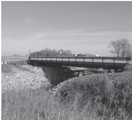
Completed Winnebago County Bridge.

The results of this research show that proper flatcar selection, construction, and engineering make flatcar bridges a viable, economical replacement bridge