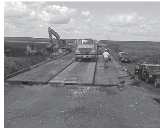
Testing of Winnebago County Bridge before connecting adjacent flatcars.

The Winnebago County bridge incorporated three 89-foot-long flatcars side by side. Preliminary calculations, however, indicated that the flatcars were not adequate as 89-foot simple spans. Therefore, new steel-capped piers were placed to support the flatcars at the bolsters—that is, where the wheels had been