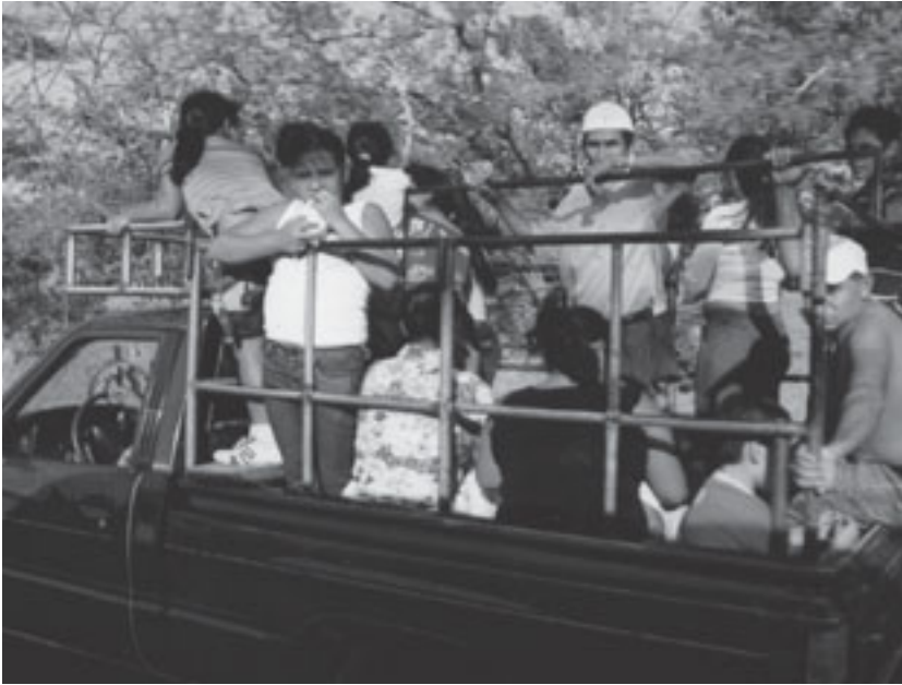
Open-bed trucks are typical modes of transport in El Salvador.

◆ U.S. programs also could derive lessons from the response to other global health crises, including the HIV-AIDS epidemic. The lag between recognition of the epidemic and the scaling up of a response resulted in enormous numbers of deaths and illnesses, as well as increases in the costs of prevention and treatment. Mounting a large-scale response required scientific evidence of the magnitude of the threat and of the effectiveness of interventions, the political will to commit resources, and a social strategy for organizing effective interventions.